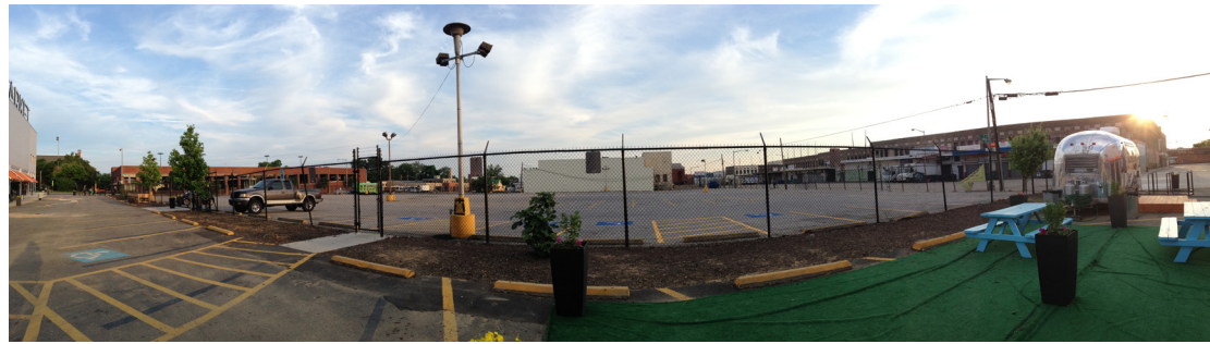
SOUTH OPEN SPACE