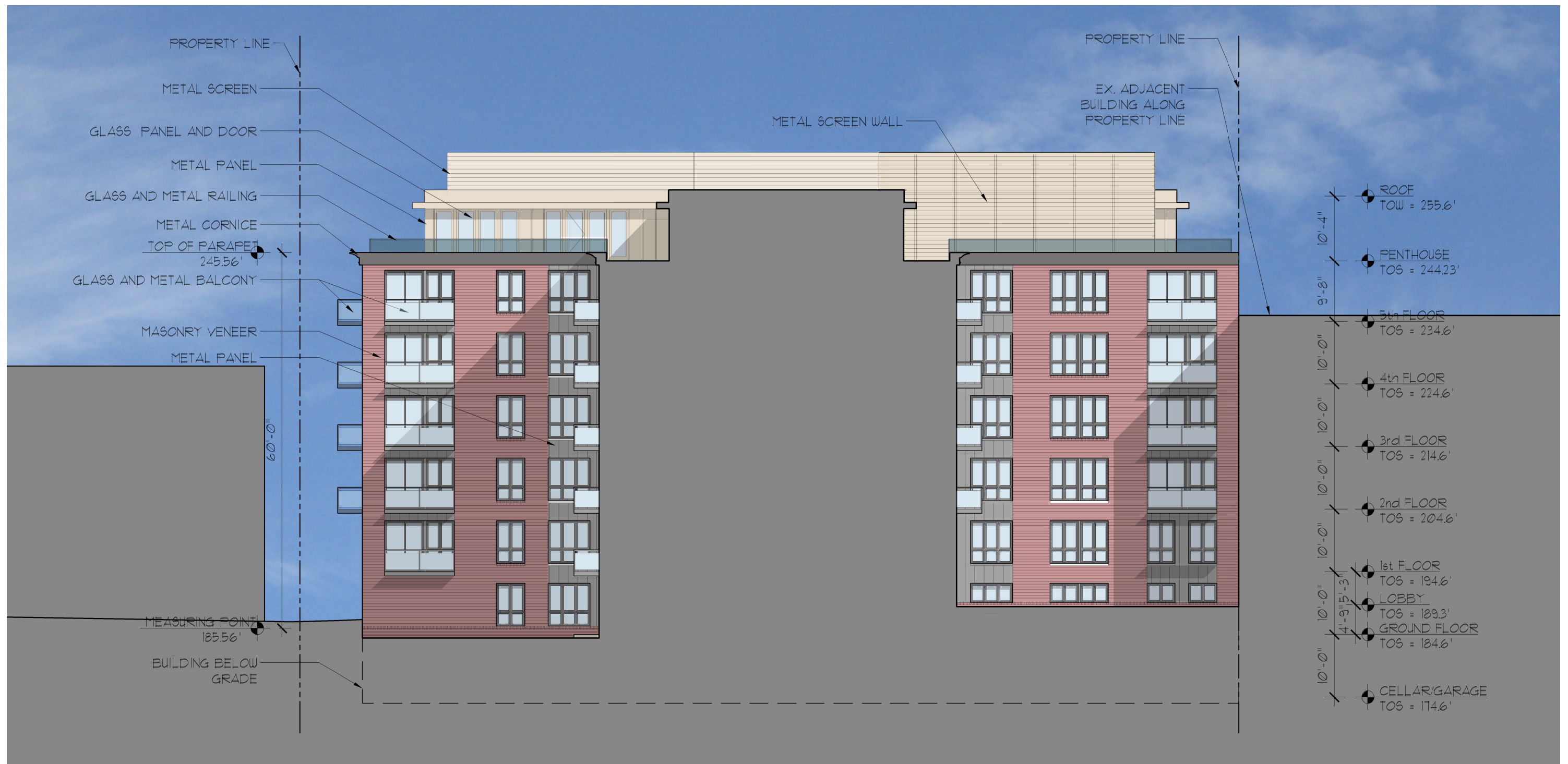
NORTH COURT ELEVATIONS 1" = 16'-0"