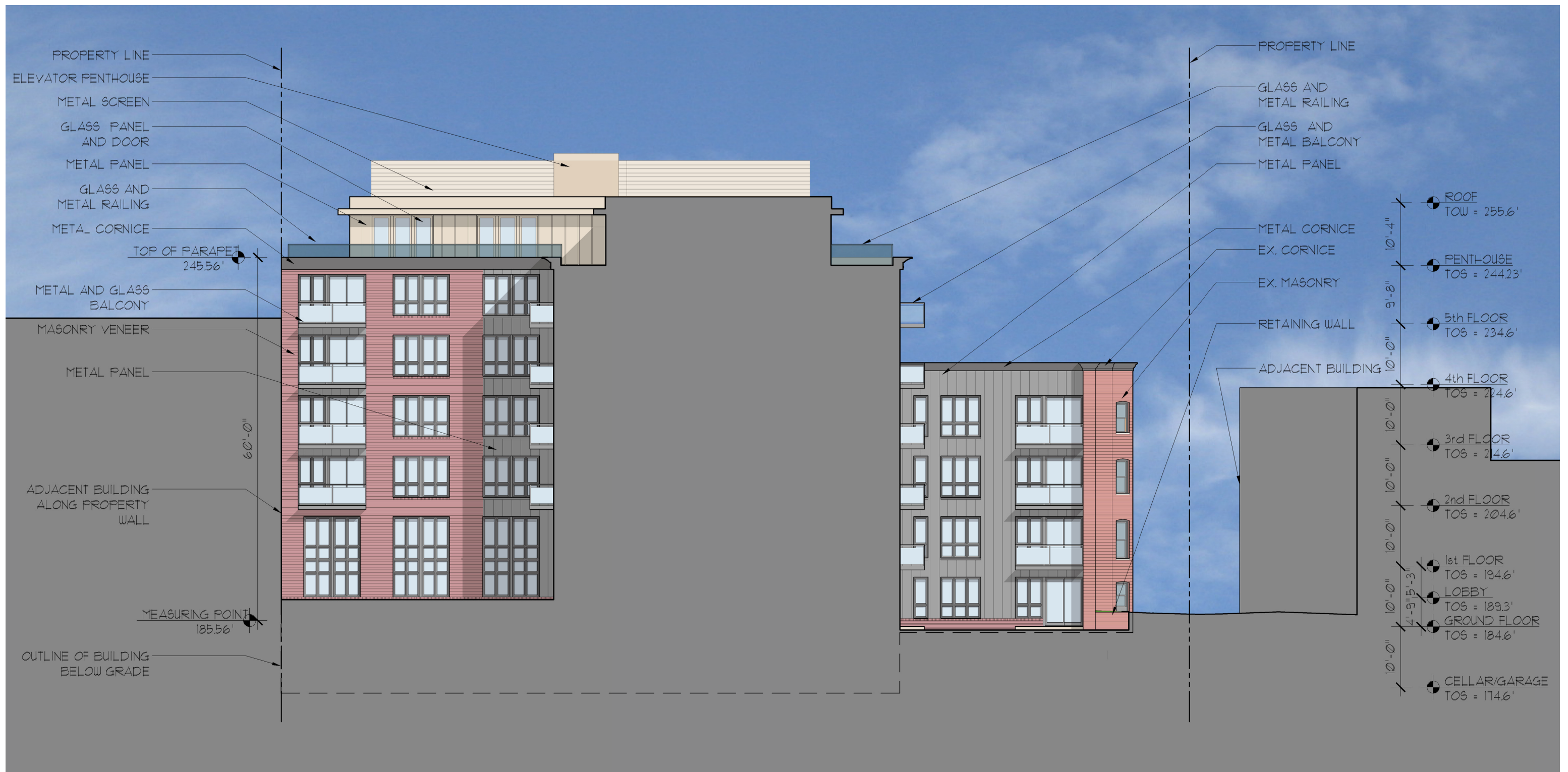
SOUTH COURT ELEVATIONS 1" = 16'-0"