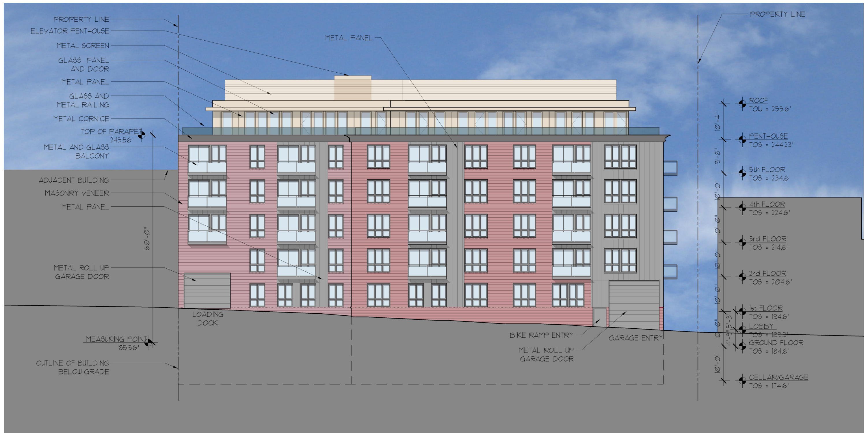
NORTH ELEVATION 1" = 16'-0"