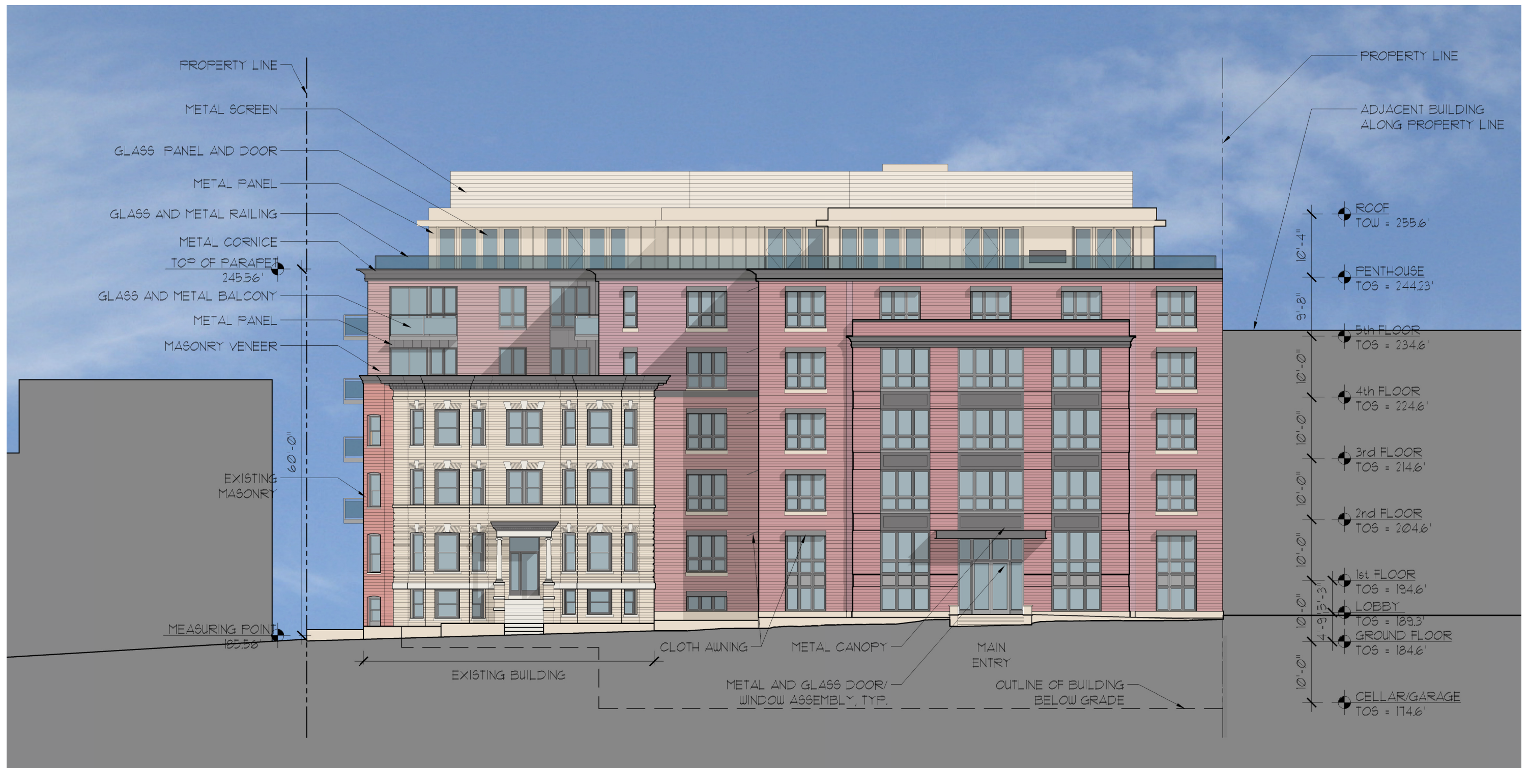
SOUTH ELEVATION 1" = 16'-0"