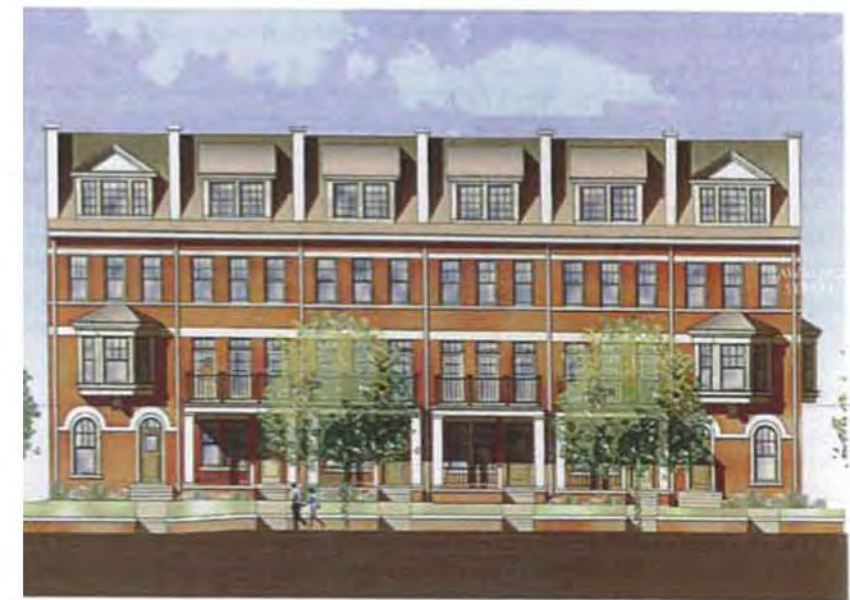
*PROPOSED STREETSCAPE ELEVATION OF CATHOLIC UNIVERSITY SOUTH CAMPUS REDEVELOPMENT