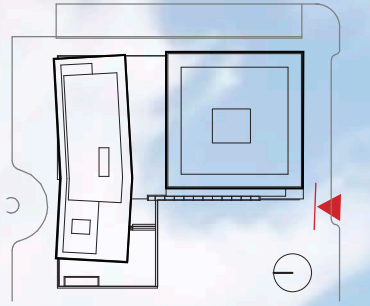
Image 3 - Overall from Hotel

PUD Stage II Filing: Capitol Crossing III LLC and Capitol Crossing IV LLC: Square 566, Lots 861-862 (part of Record Lot 50)