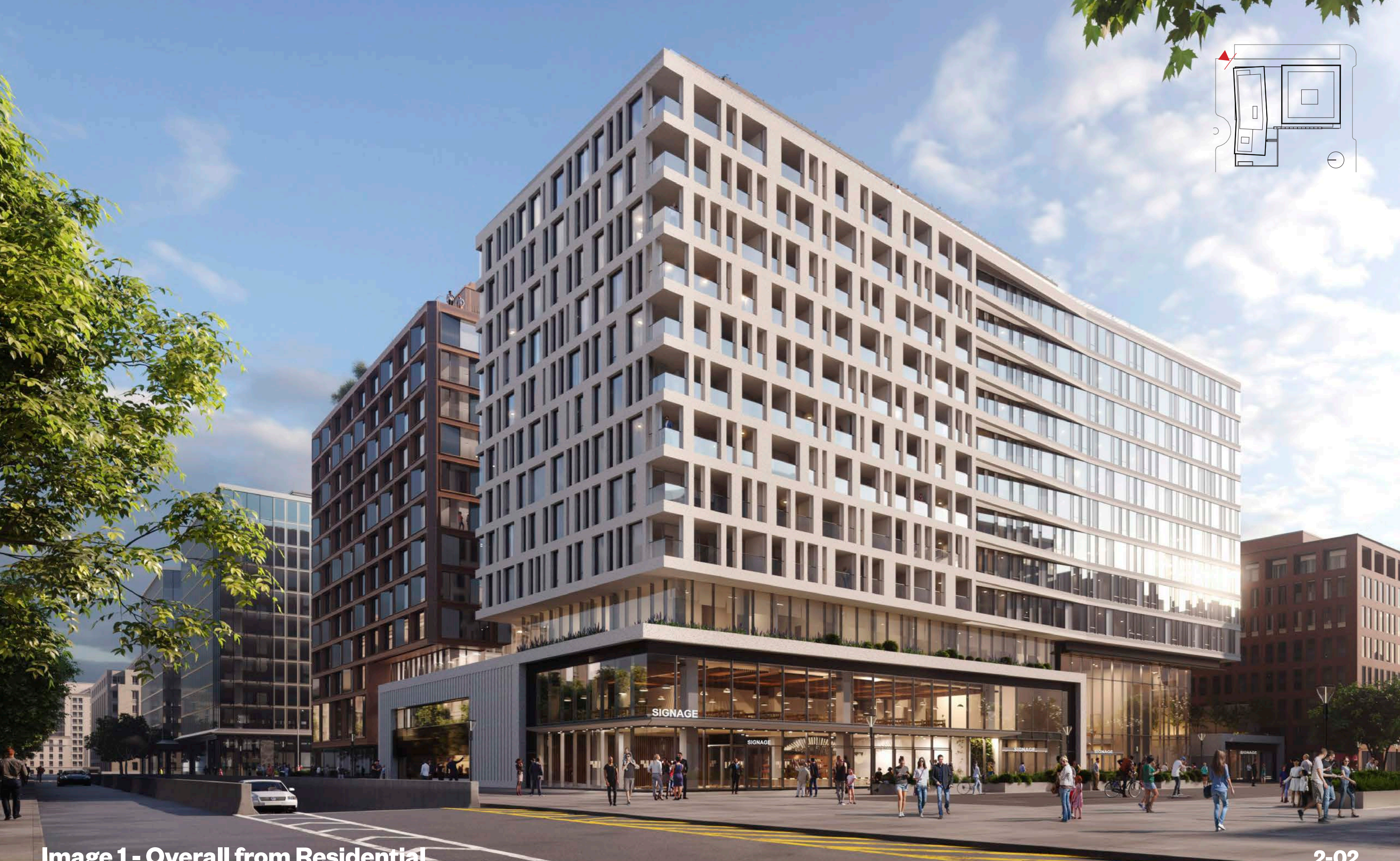
Image 1 - Overall from Residential

PUD Stage II Filing: Capitol Crossing III LLC and Capitol Crossing IV LLC: Square 566, Lots 861-862 (part of Record Lot 50)