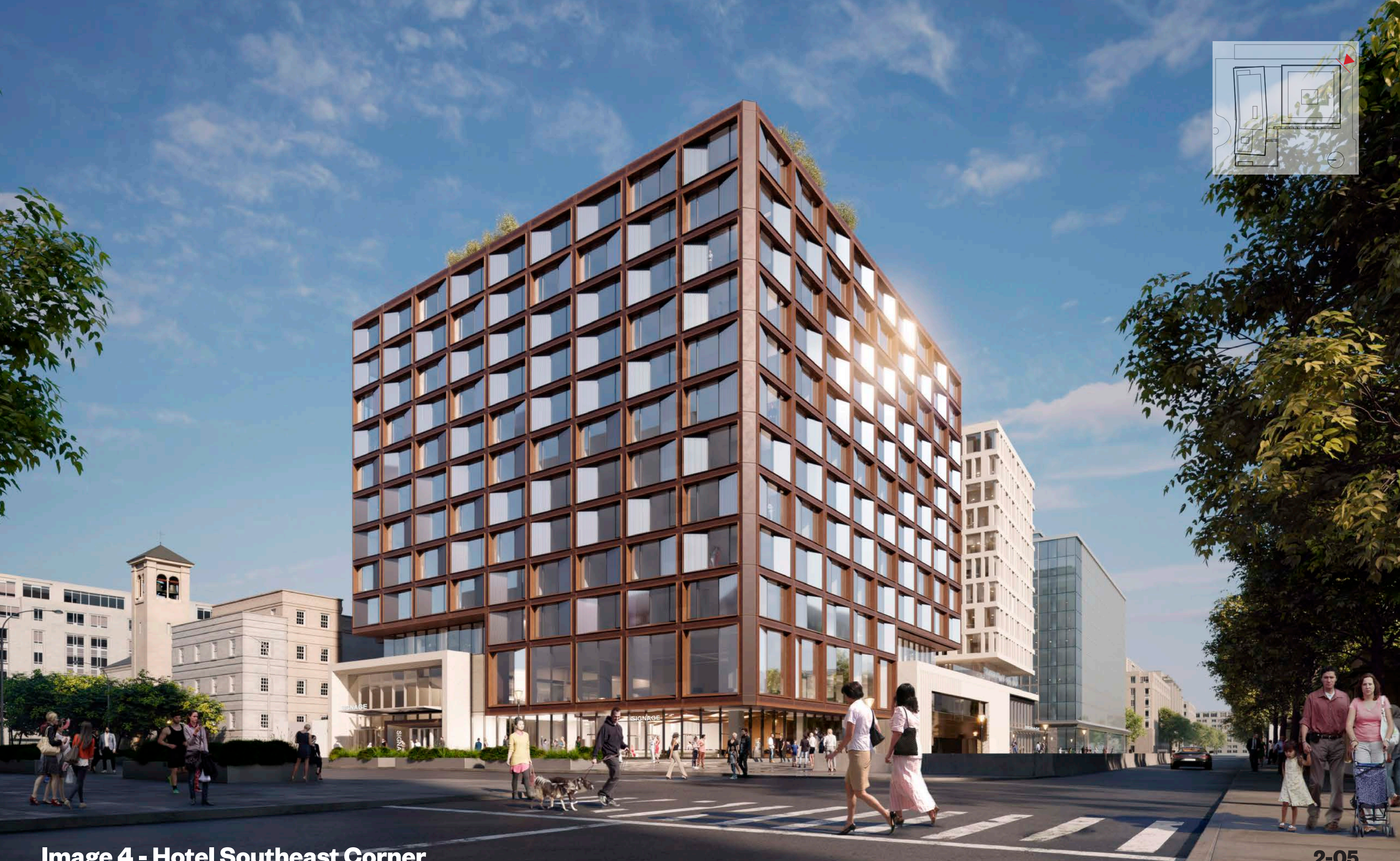
Image 4 - Hotel Southeast Corner

PUD Stage II Filing: Capitol Crossing III LLC and Capitol Crossing IV LLC: Square 566, Lots 861-862 (part of Record Lot 50)