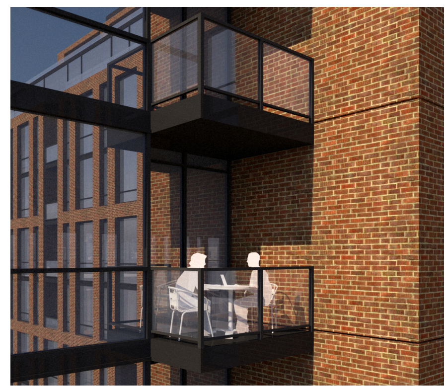
STEPPED FACADE BALCONY DETAIL