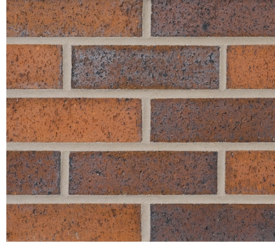
BR-1 BRICK MONARCH VELOUR GLEN GERY BRICK