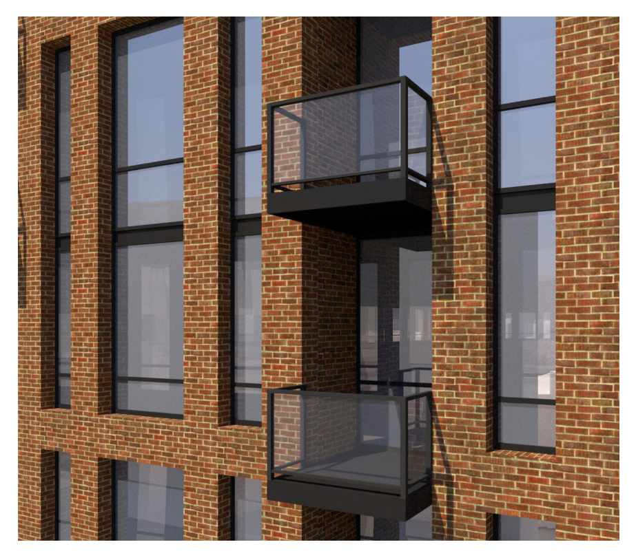
SOUTH CAPITOL BALCONY DETAIL