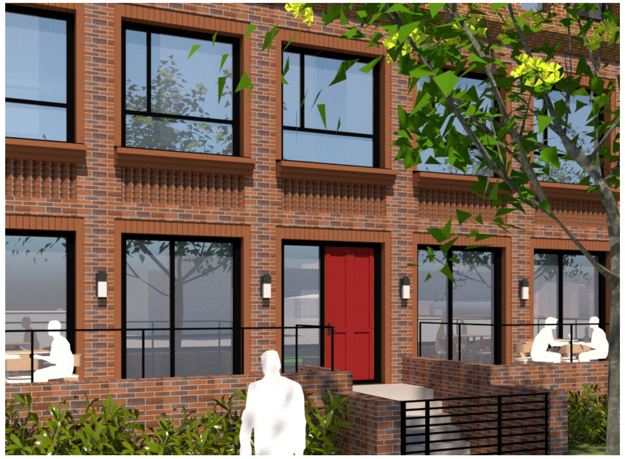
NEW PROPOSED SOUTH CAPITOL TOWNHOUSES