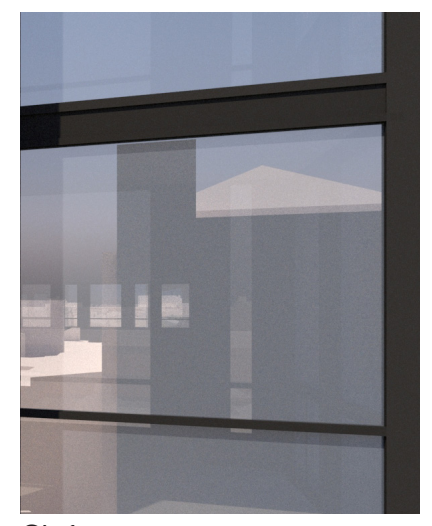
GL-1 GLASS SYSTEM