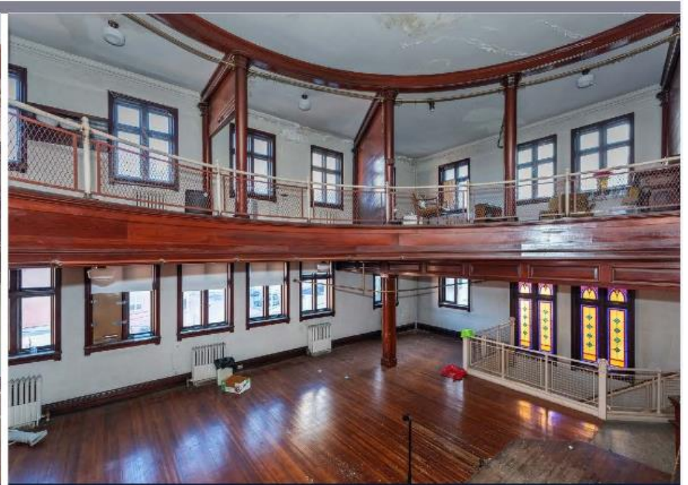
2ND LEVEL AUDITORIUM CLASSROOMS