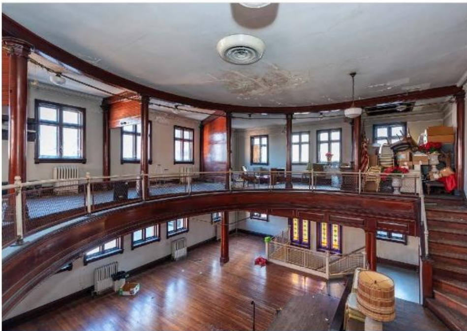
2ND LEVEL AUDITORIUM CLASSROOMS