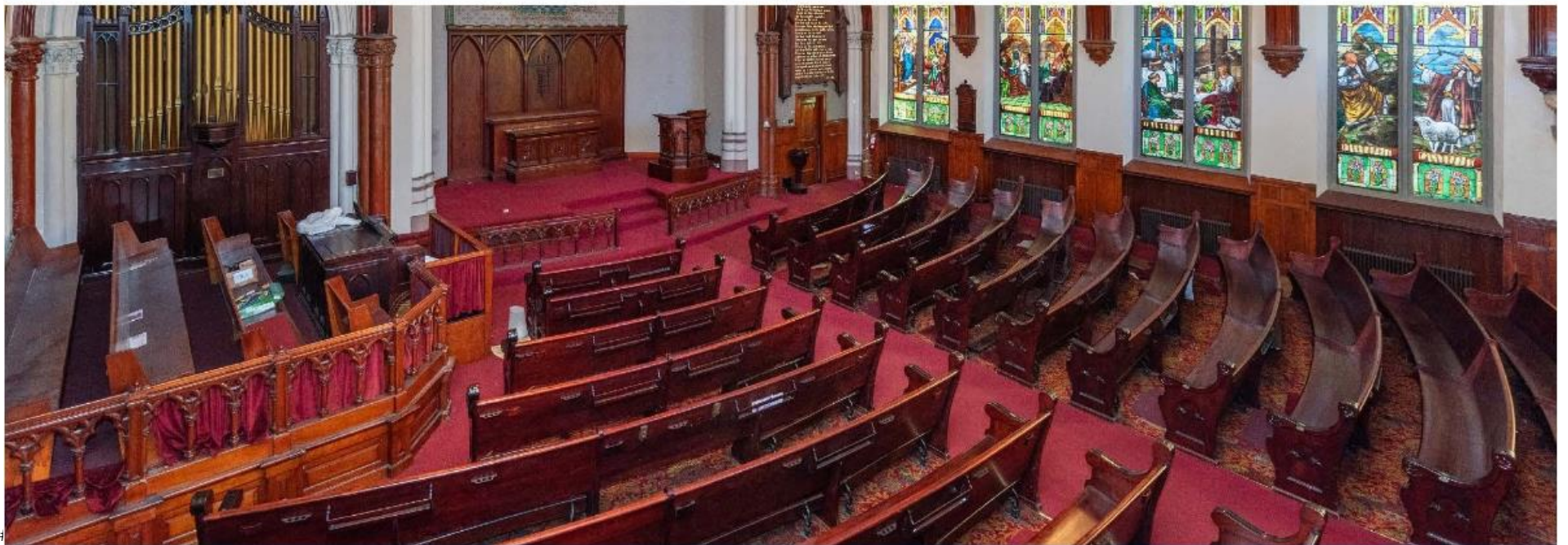
BIRDSEYE SANCTUARY BALCONY