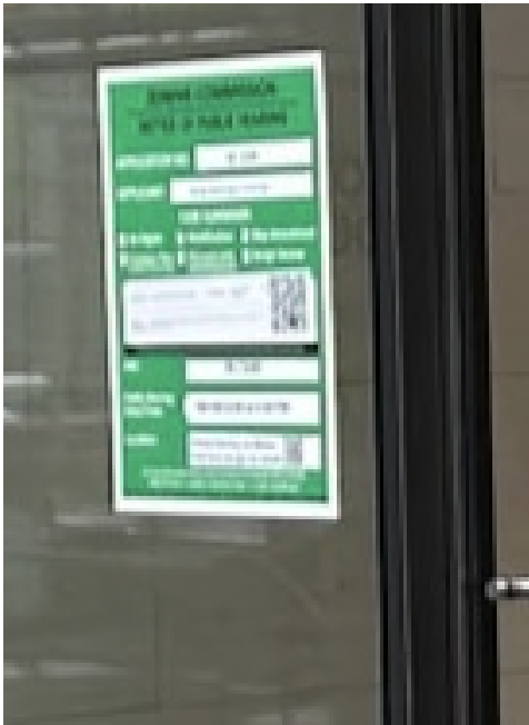
1. 4/28/2026 Pennsylvania Ave NW