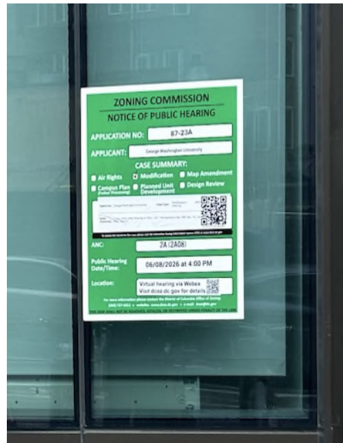
2. 4/28/2026 20 th Street NW