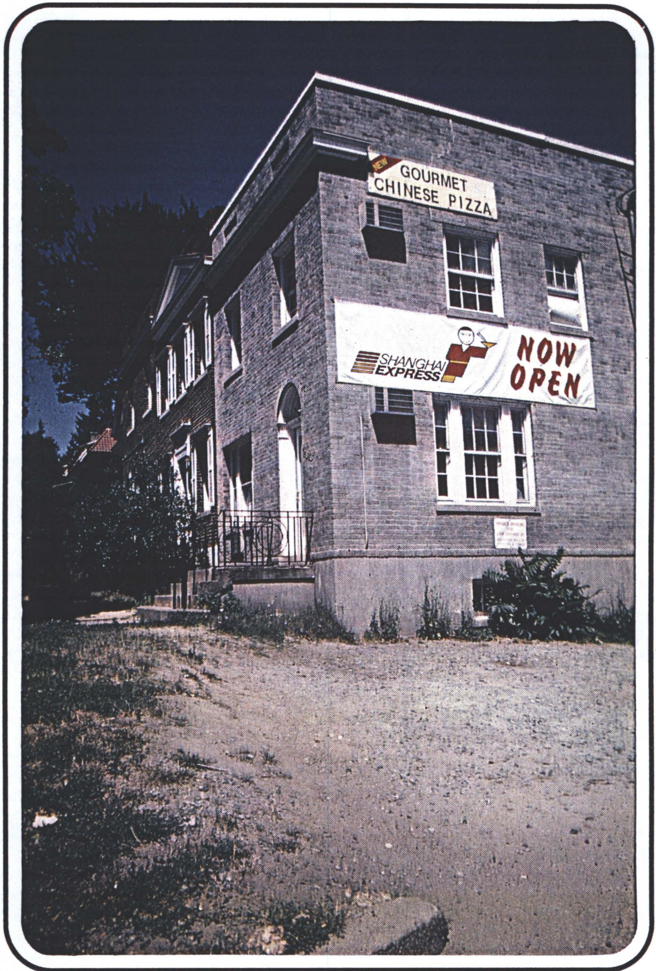
#5 New use for 2815 Ordway - sign advertises to Conn. Ave. pedestrians + motorists