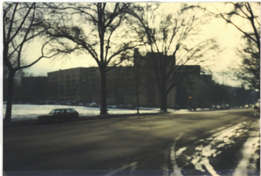
R-1-A to R-5-C Connecticut & Brandywine (Brandywine Apts.)