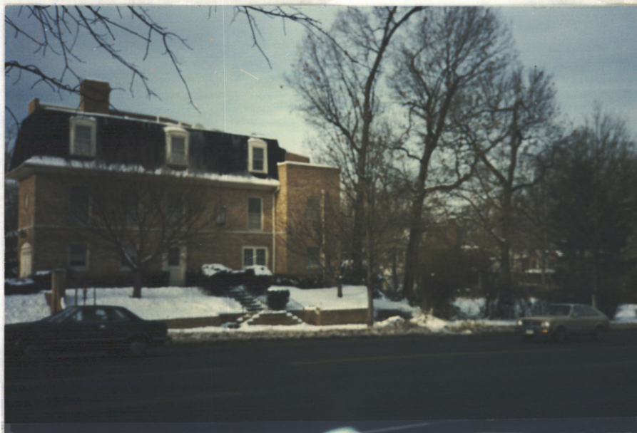
R-5-C Square 1872 Connecticut Ave. & Military Rd.