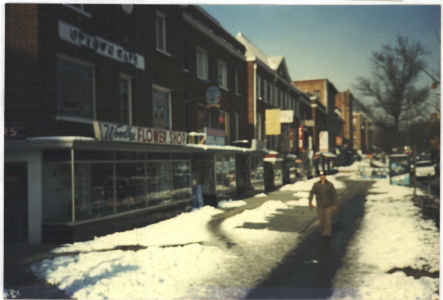
Cleveland Park Square 2068 Connecticut & Ordway