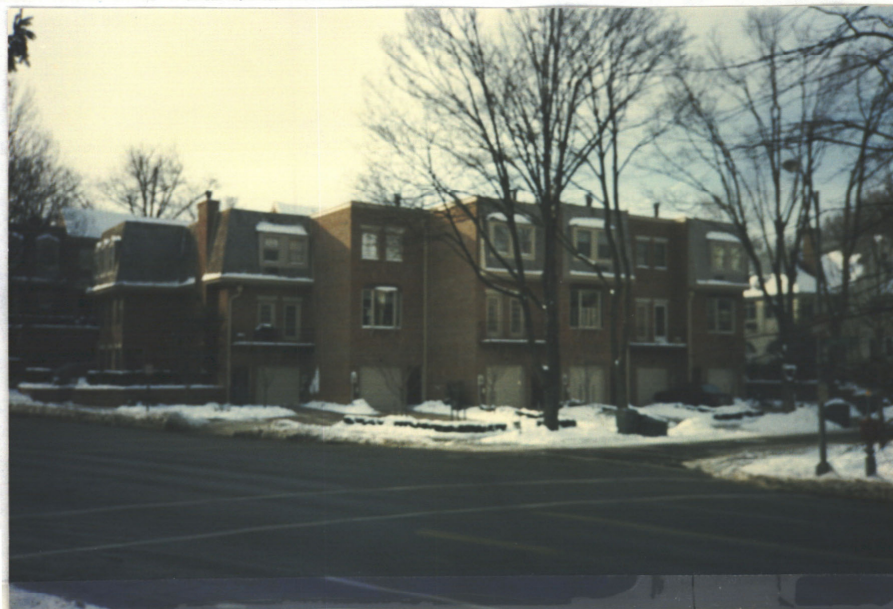
R-5-C R-5-C Square 1872 (South) Connecticut & Kanawha