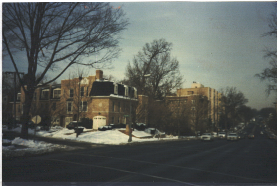
R-5-C Square 1872 (North) Connecticut Ave. & Military Rd.