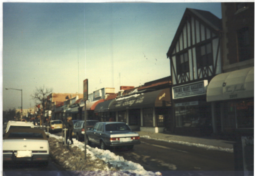
Cleveland Park Square 2218 Connecticut & Macomb