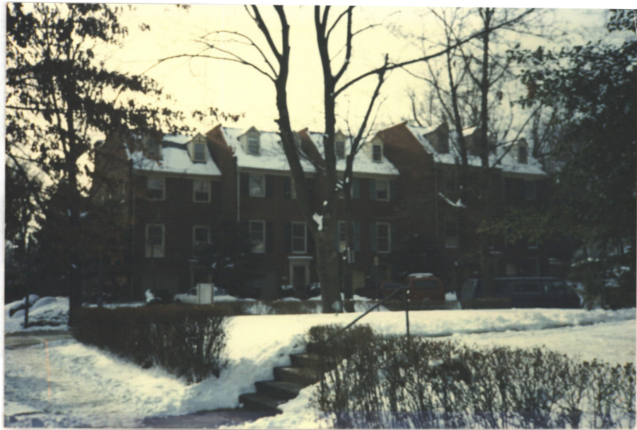
R-5-C Square 1875 (South) Connecticut & Jenifer