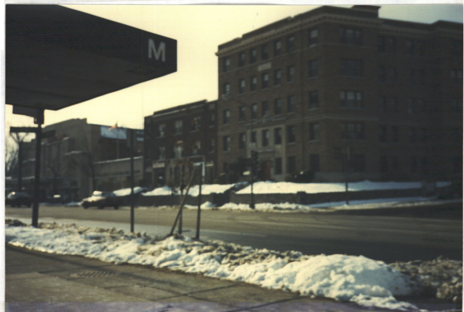
Cleveland Park Square 2069 Connecticut & Ordway