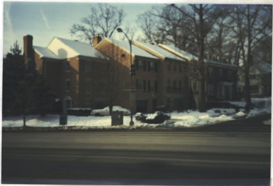
R-5-C Square 1876 (South) Connecticut & Huntington