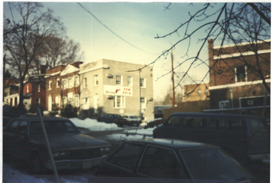
Cleveland Park Square 2068 Ordway Street