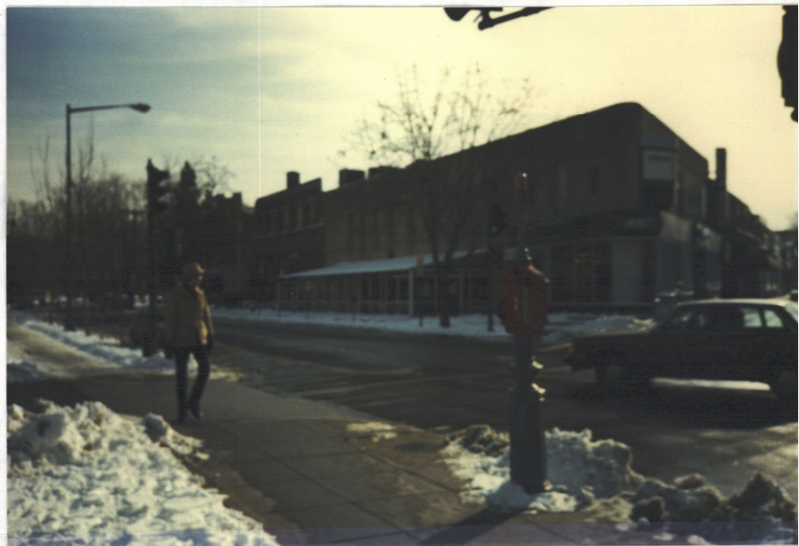
Cleveland Park Square 2218 Connecticut & Ordway