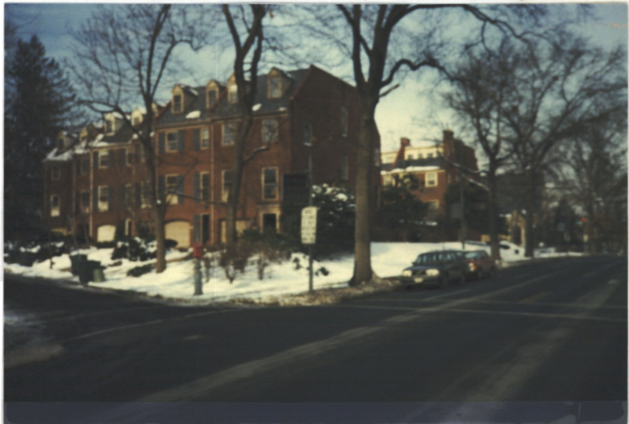
R-5-C Square 1875 (South) Connecticut & Ingomar