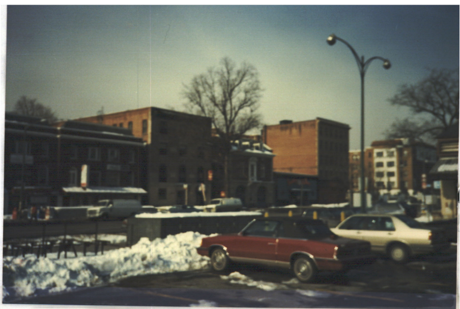
Cleveland Park Square 2068 Connecticut & Porter