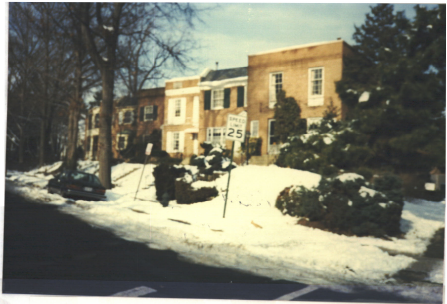
R-5-C Square 1876 (South) Connecticut & Huntington