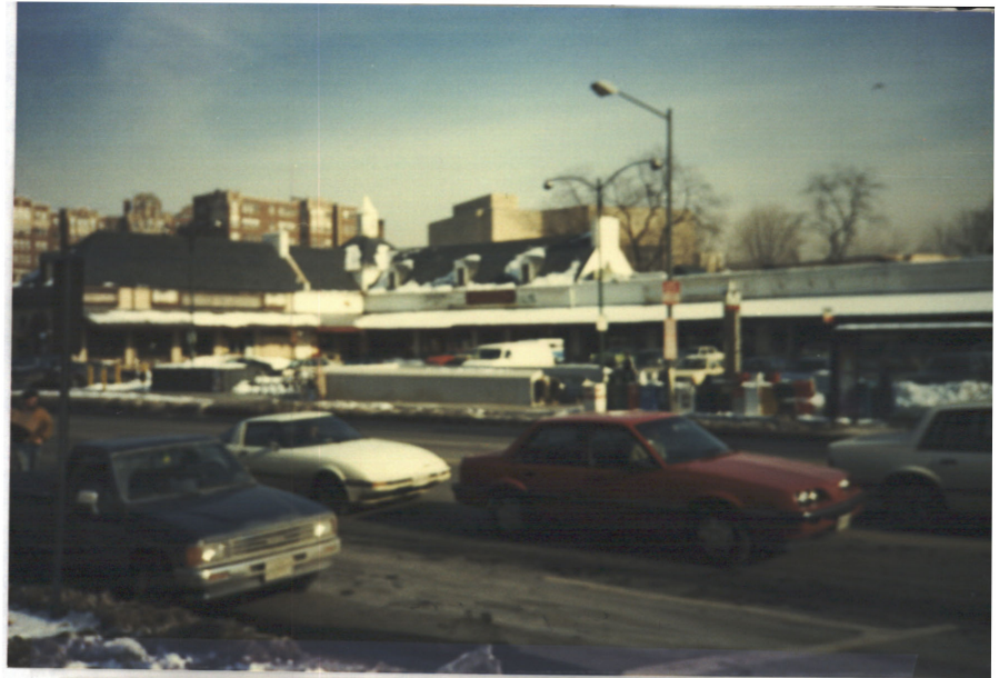
Cleveland Park Square 2222 Connecticut & Porter