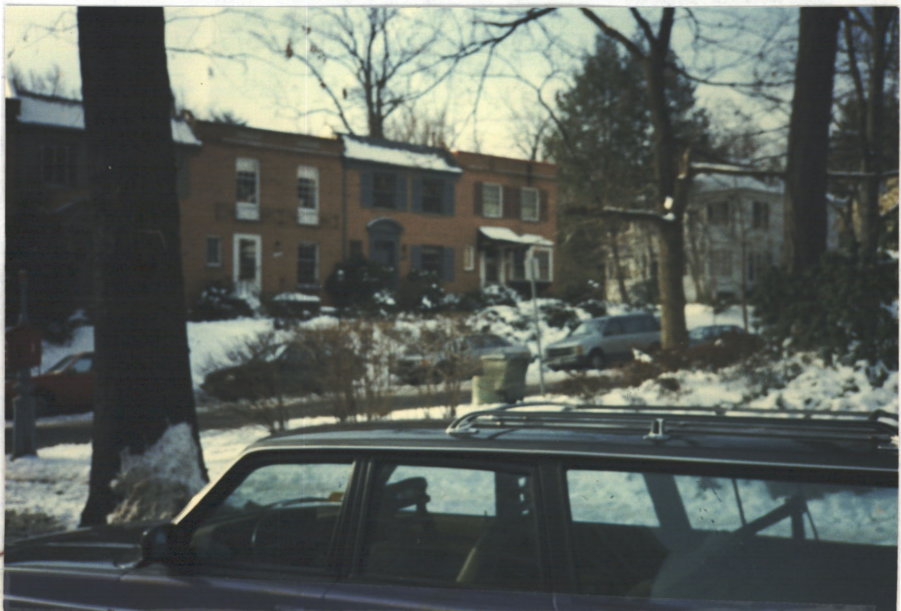
R-5-C Square 1876 (North) Connecticut & Ingomar