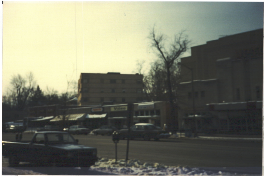
Cleveland Park Square 2069 Connecticut & Newark