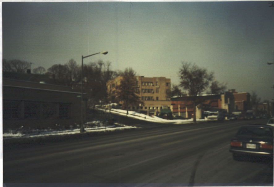
Cleveland Park Square 2082-2069 Connecticut & Newark