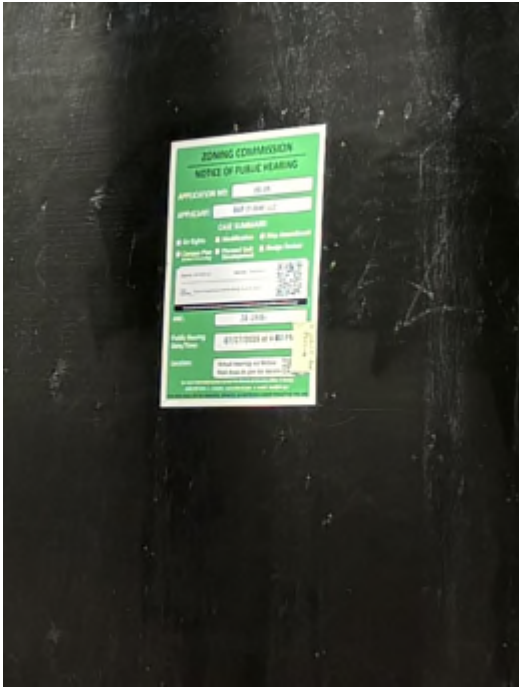
1. 6/16/2026 21st Street NW