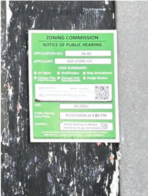
3. 6/16/2026 New Hampshire Avenue NW