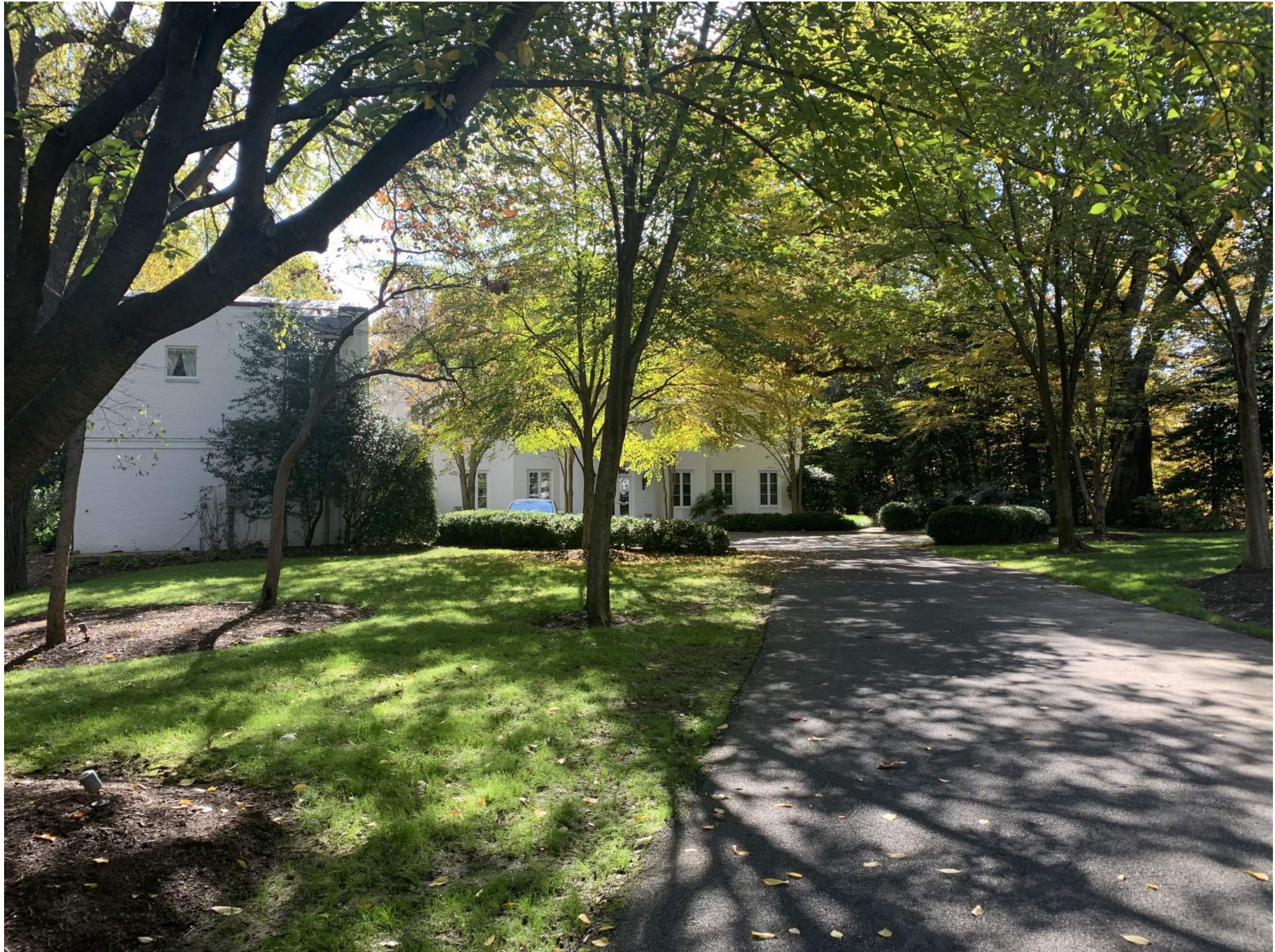
VIEW TO DIRECTOR'S RESIDENCE THE CENTER FOR HELLENIC STUDIES