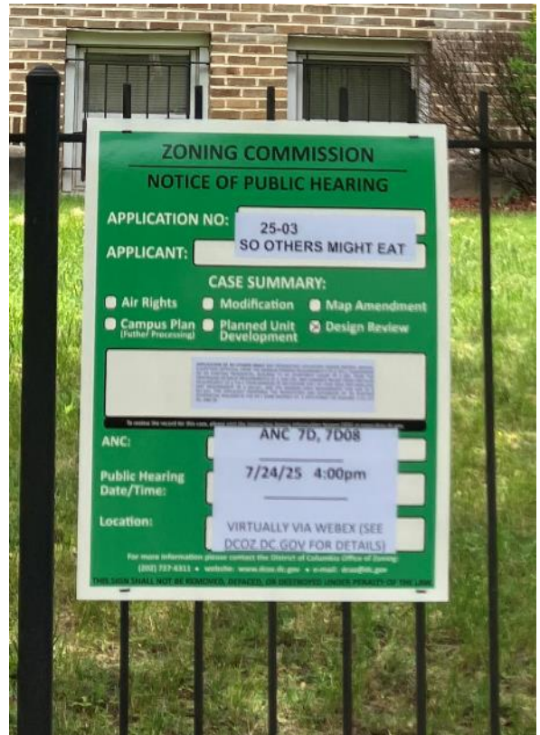
4. 6/10/2025 East Capitol St SE