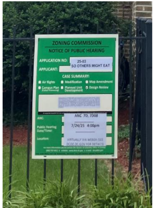
2. 6/10/2025 18 th St SE