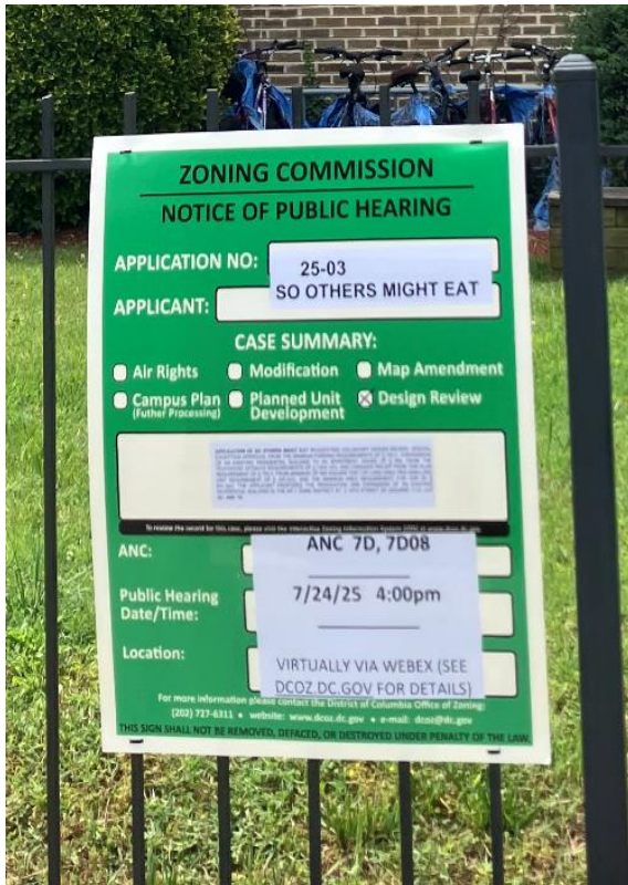
3. 6/10/2025 East Capitol St SE