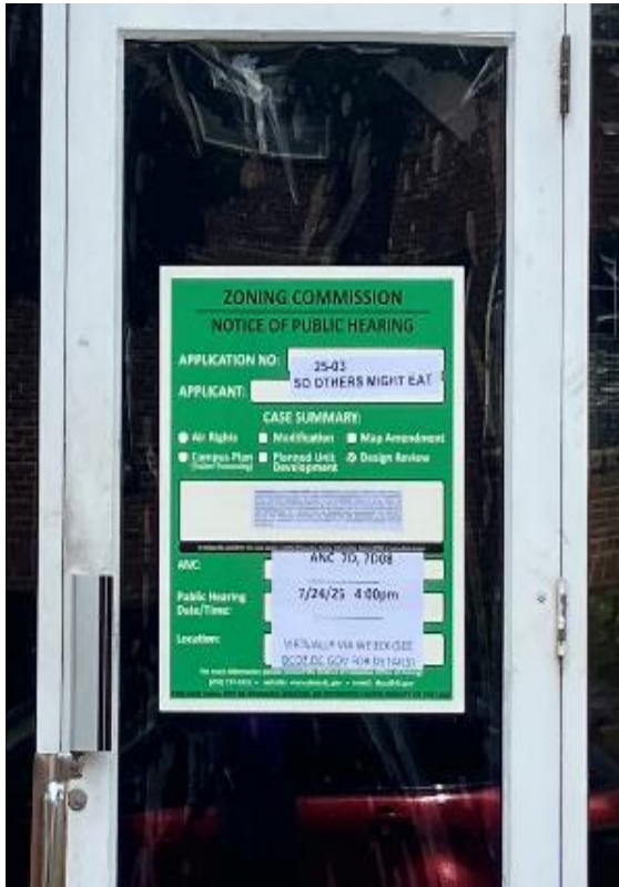
1. 6/10/2025 18 th St SE