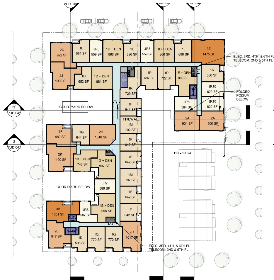
① Level 3 - 4 (Typ. Floors) 1" = 50'-0"