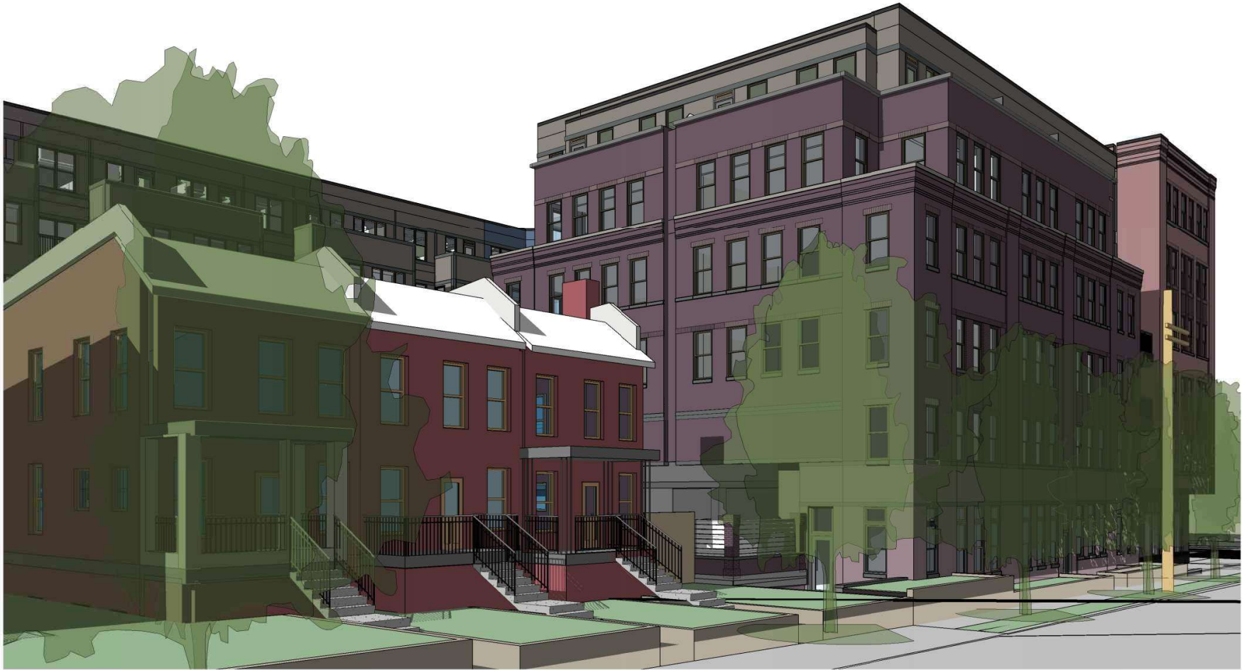
PROPOSED SCULPTING @ 5TH AND 6TH FLOORS

* BRICK RETURNS ABOVE 4TH FLOOR TO BE THIN BRICK WHERE NOT ABLE TO BE SUPPORTED BY VENEER WALL