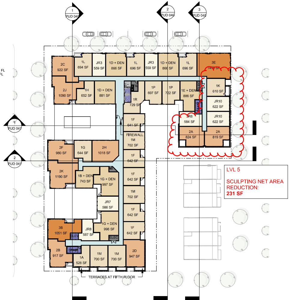
③ Level 5 1" = 50'-0"