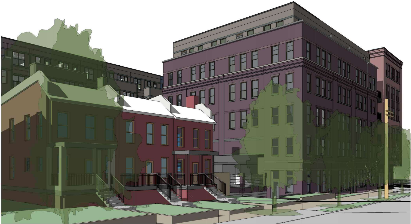
BUILDING MASSING - PUD RESUBMISSION - 04/21/25