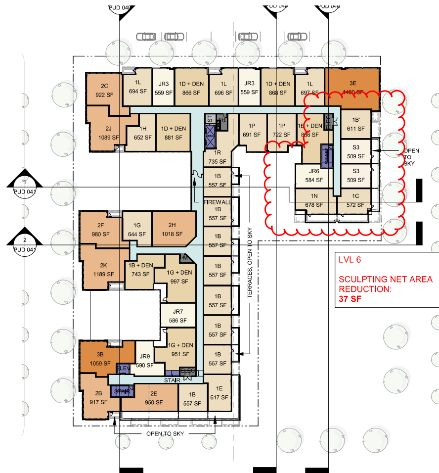
① Level 6 1" = 50'-0"