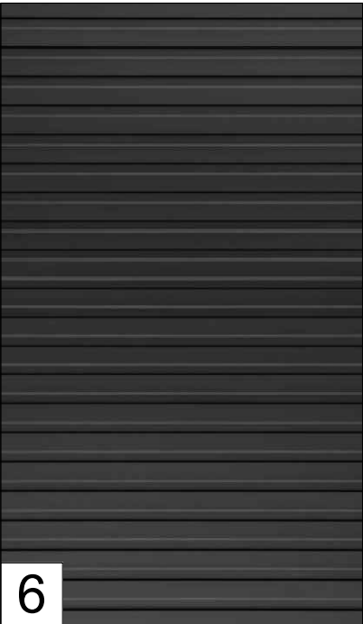
6 CORRUGATED METAL PANEL