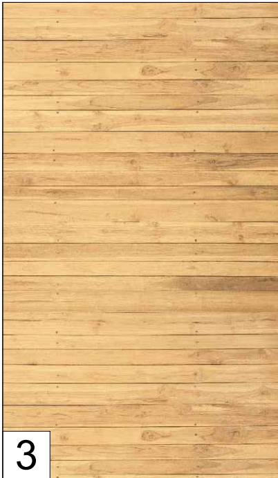
3 TEXTURED METAL PANEL