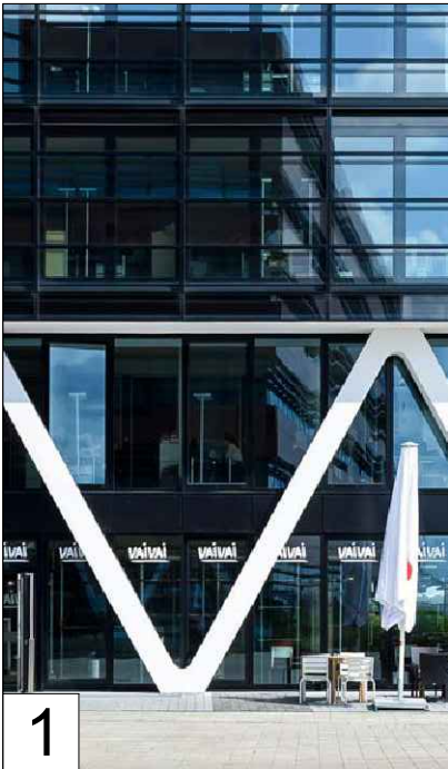
1 METAL CANOPY SYSTEM