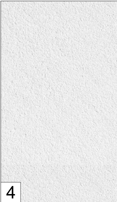
4 METAL PANEL