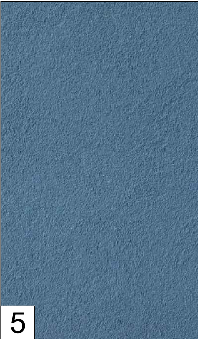
5 METAL PANEL