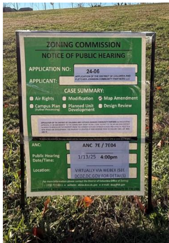
4. 12/3/24 St. Louis St SE