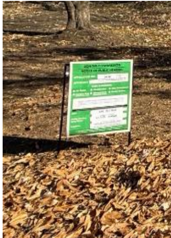
2. 12/3/24 Benning Rd SE #2