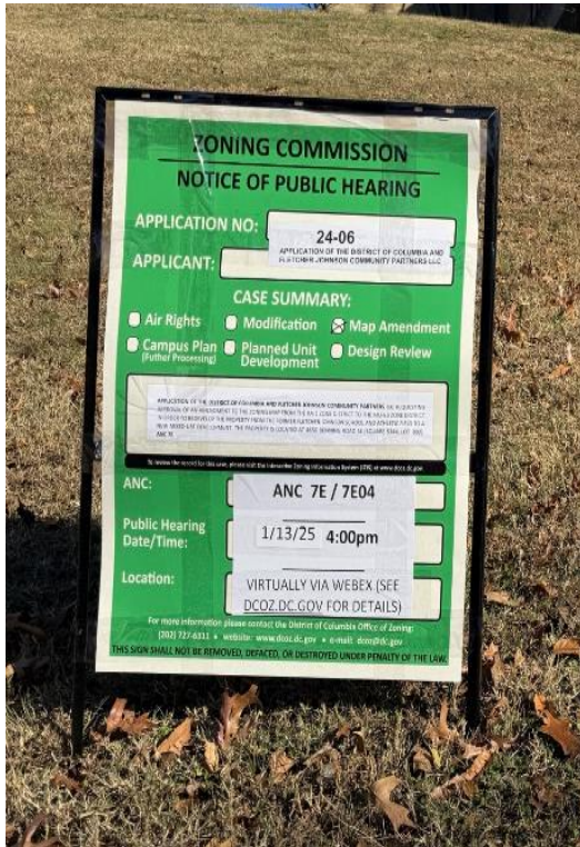
1. 12/3/24 Benning Rd SE #1