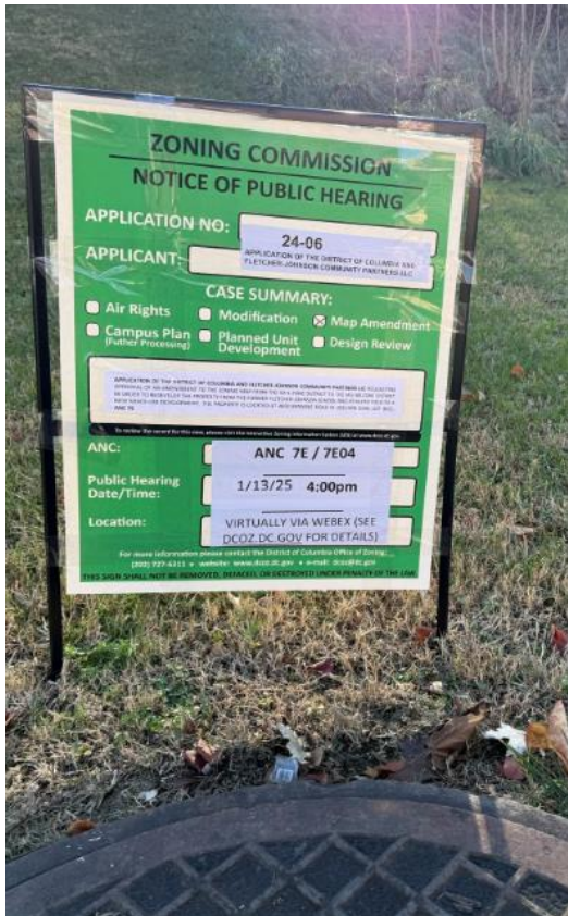
3. 12/3/24 C St SE