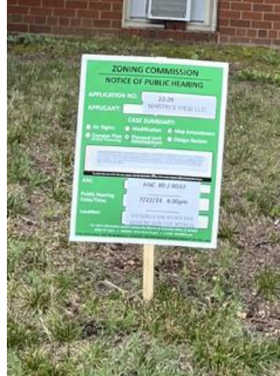
5. 6/11/24 MLK, Jr. Ave SW # 2