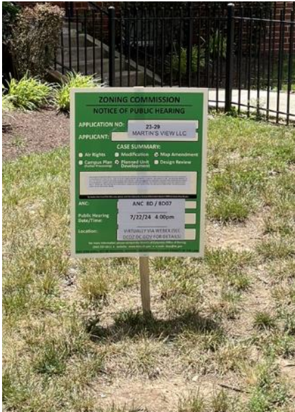
1. 6/11/24 Elmira St SW # 1