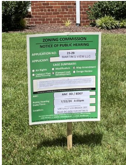
7. 6/11/24 Elmira St SW # 5