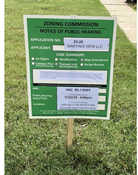
3. 6/11/24 Elmira St SW # 3