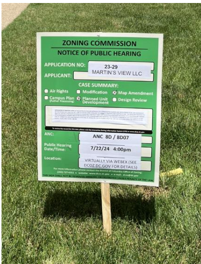
6. 6/11/24 Elmira St SW # 4