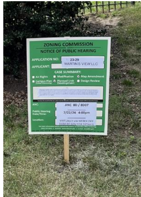
10. 6/11/24 MLK, Jr. Ave SW # 4