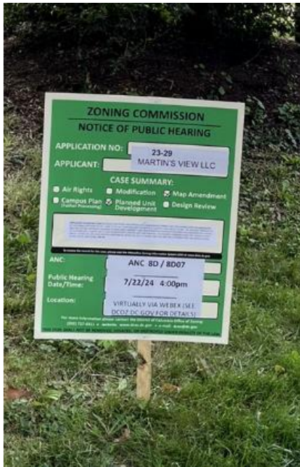
9. 6/11/24 MLK, Jr. Ave SW # 3