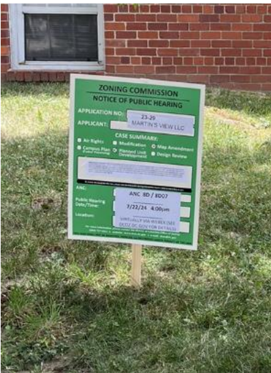
4. 6/11/24 MLK, Jr. Ave SW # 1