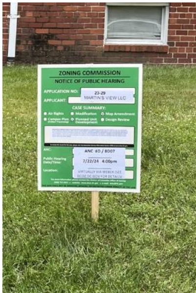
2. 6/11/24 Elmira St SW # 2