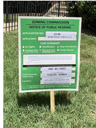
8. 6/11/24 Elmira St SW # 6