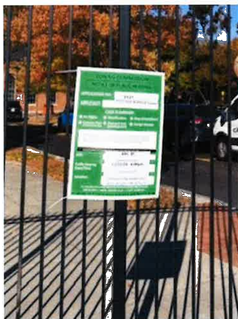
4. 10/31/24 Anacostia Channel #1