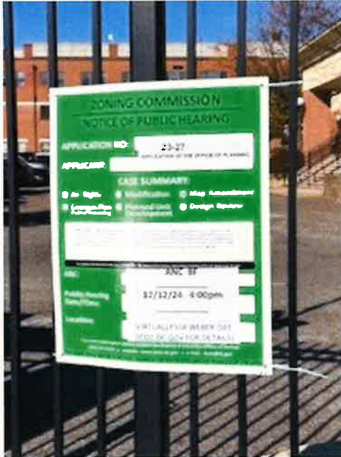
5. 10/31/24 Anacostia Channel #2