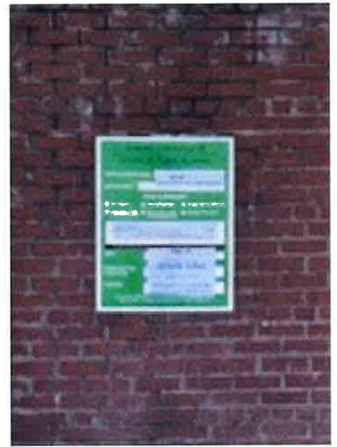
3. 10/31/24 11th Street SE