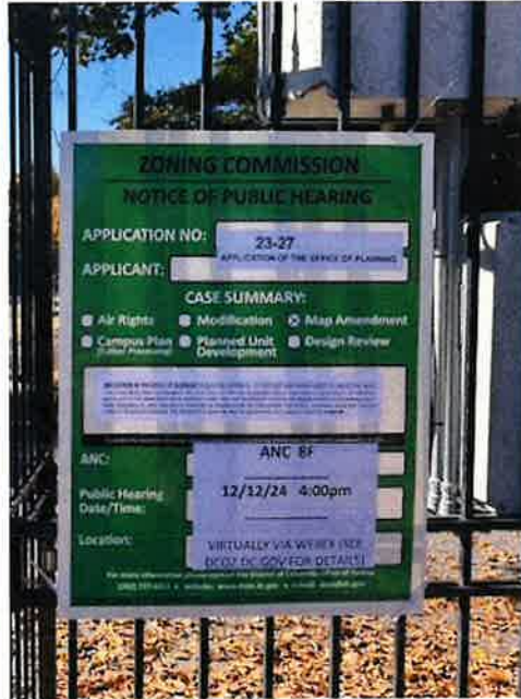
2. 10/31/24 O Street SE