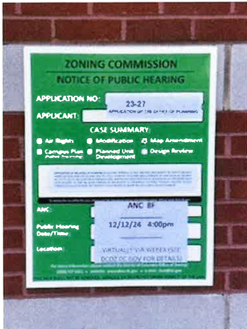
1. 10/31/24 Parsons & O Streets SE