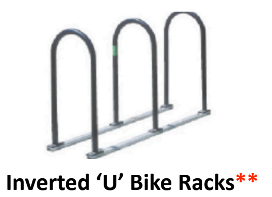
Inverted 'U' Bike Racks**

32 Racks = 64 Parking Spaces to replace existing 64 'theoretical capacity' Parking Spaces on the EHN Green