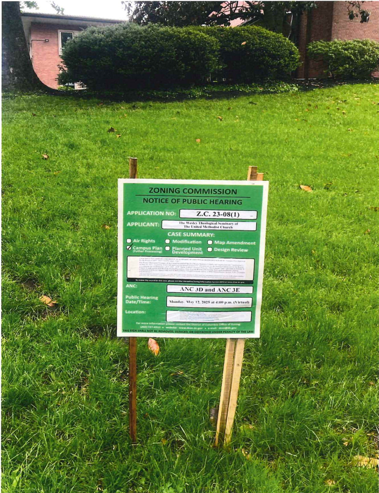
Sign # 4 reposted May 9, 2025