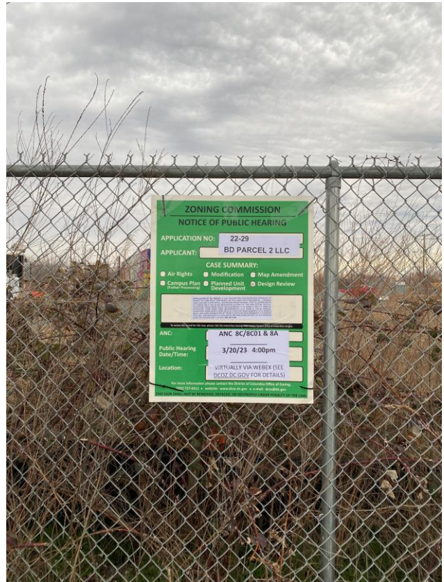
1/25/2023 Suitland Parkway SE