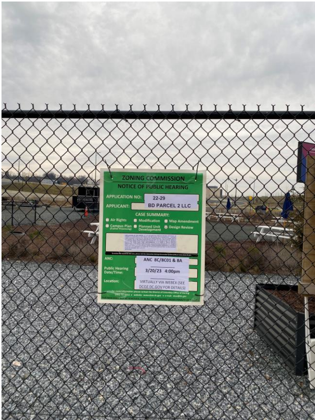
1/25/2023 Howard Road SE