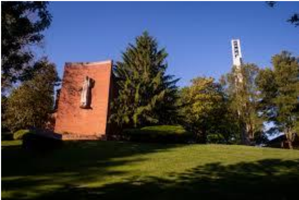
(View of Wesley Seminary from Massachusetts Avenue NW. Iconic Chapel view with image of Jesus Christ with the Bell Tower further up the sloping hillside to the right.)

At the June 13, 2022 hearing in the above referenced case, the Zoning Commission requested that Wesley Theological Seminary (WTS) provide additional information on design issues, including the relationship between the new 659-bed commercial student apartment building and the iconic Chapel adorned with an image of Jesus Christ overlooking Massachusetts Avenue NW. (See Photo Below) WTS's June 27 filing was not responsive to this request.