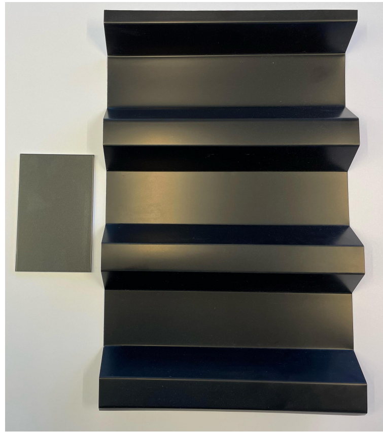
metal panel 3