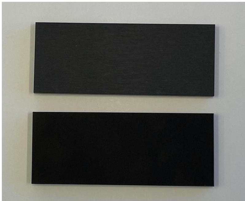
high density fiber cement