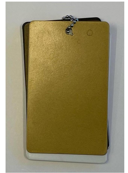
metal panel 4