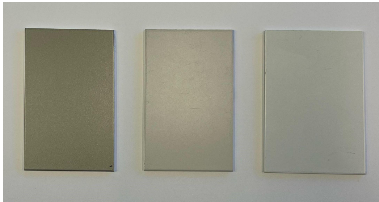
metal panel 1 & 2