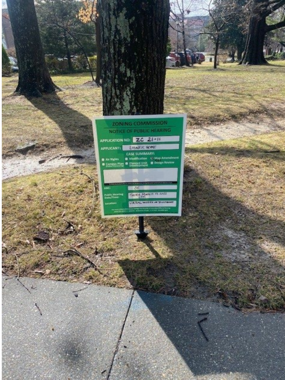
Livingston Street, NW