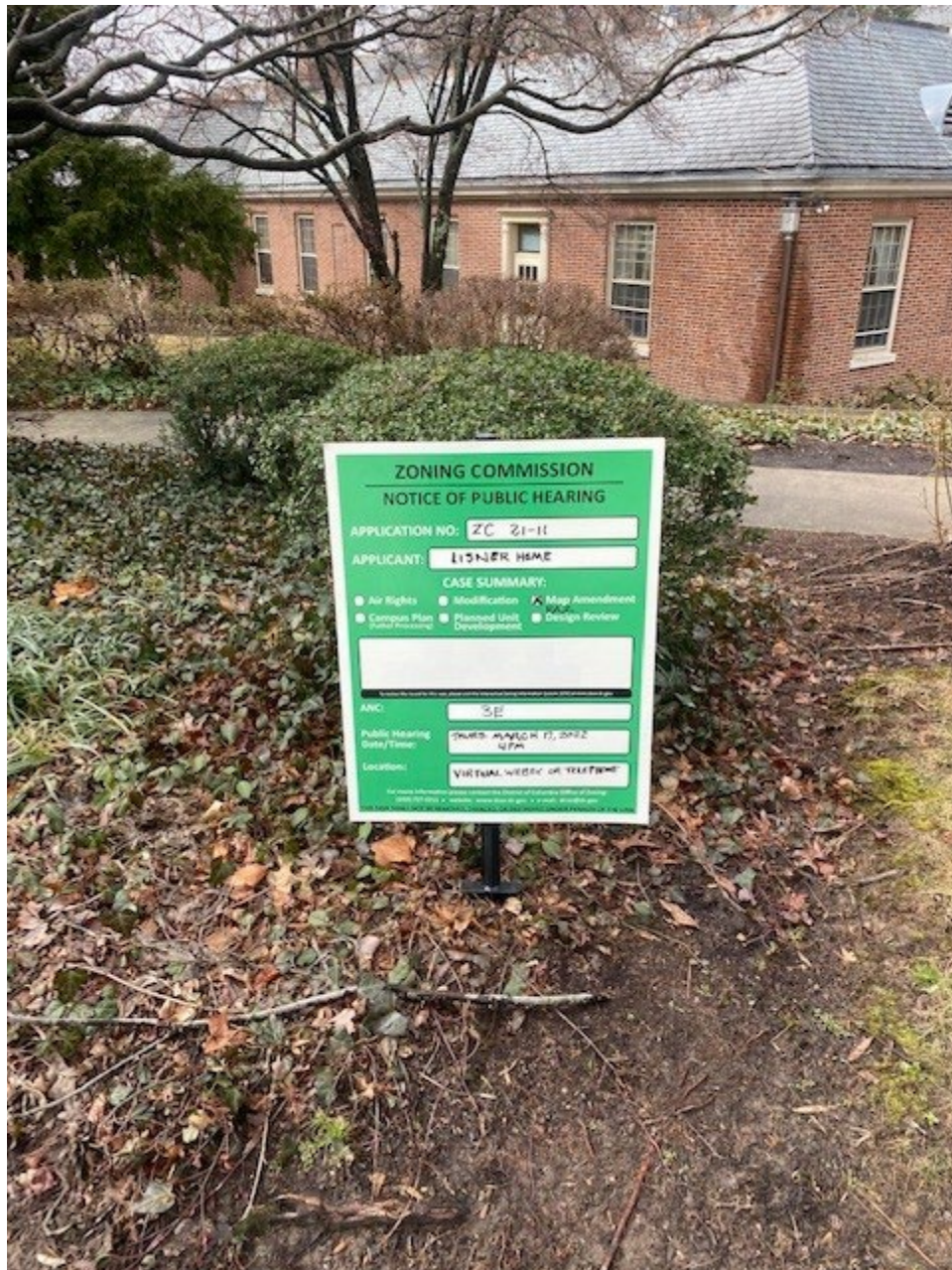
42nd Street, NW