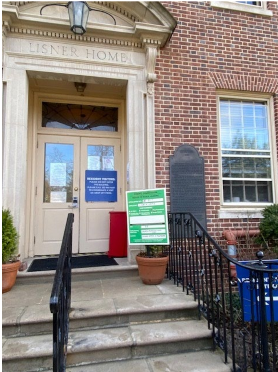
Lisner Home Building