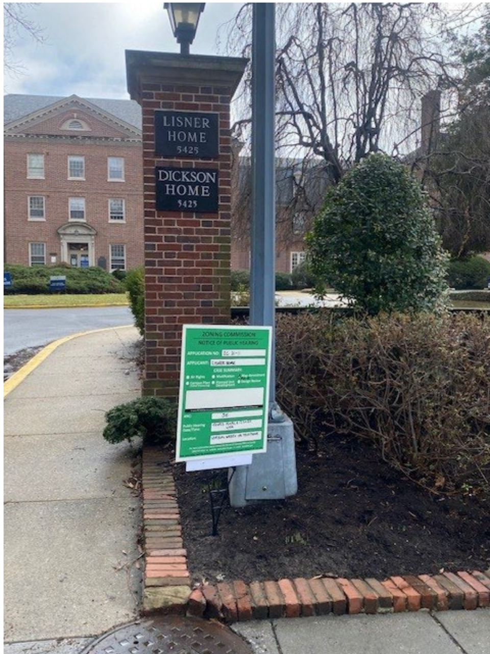
Western Avenue, NW Frontage