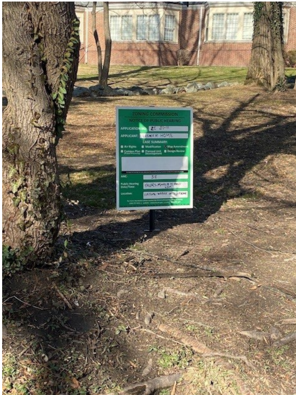
Military Road, NW