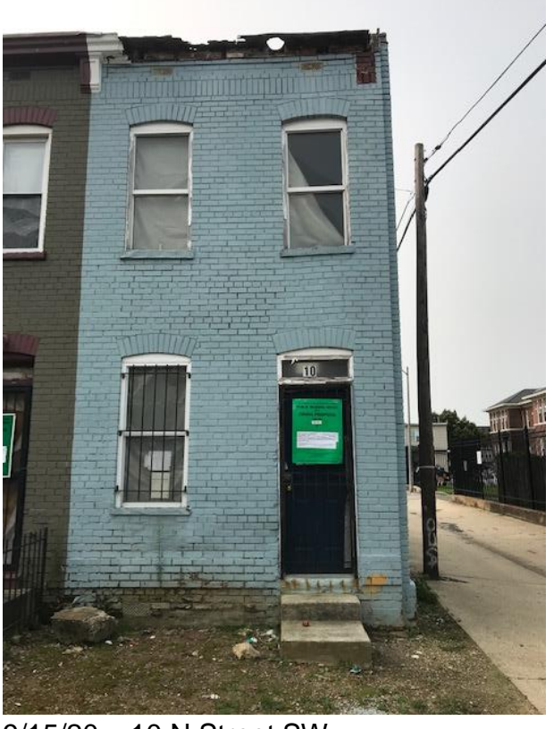
9/15/20 - 10 N Street SW