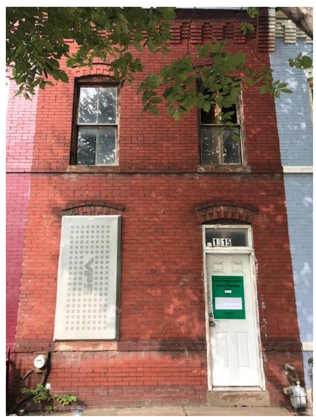
9/15/20 1315 S. Capitol Street SW