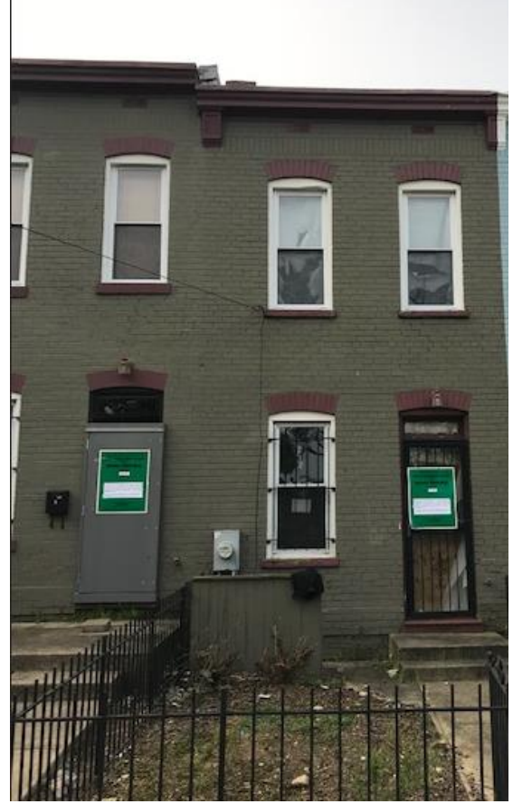
9/15/20 - 8 N St SW & 8 1/2 N Street SW