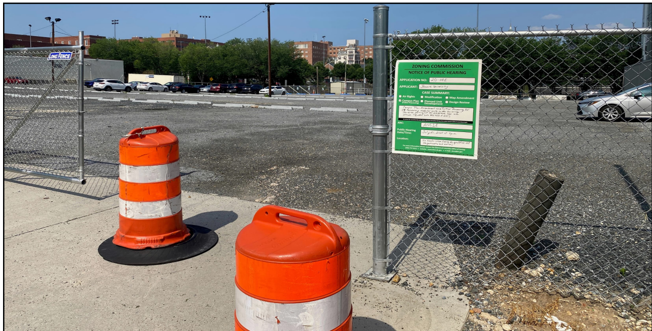
Number 2 - 2300 block 9th St NW