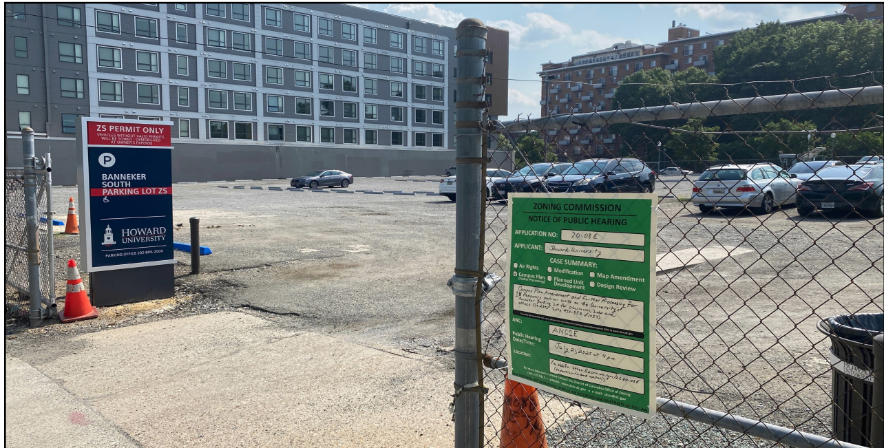
Number 1 - 2300 block Sherman Ave, NW