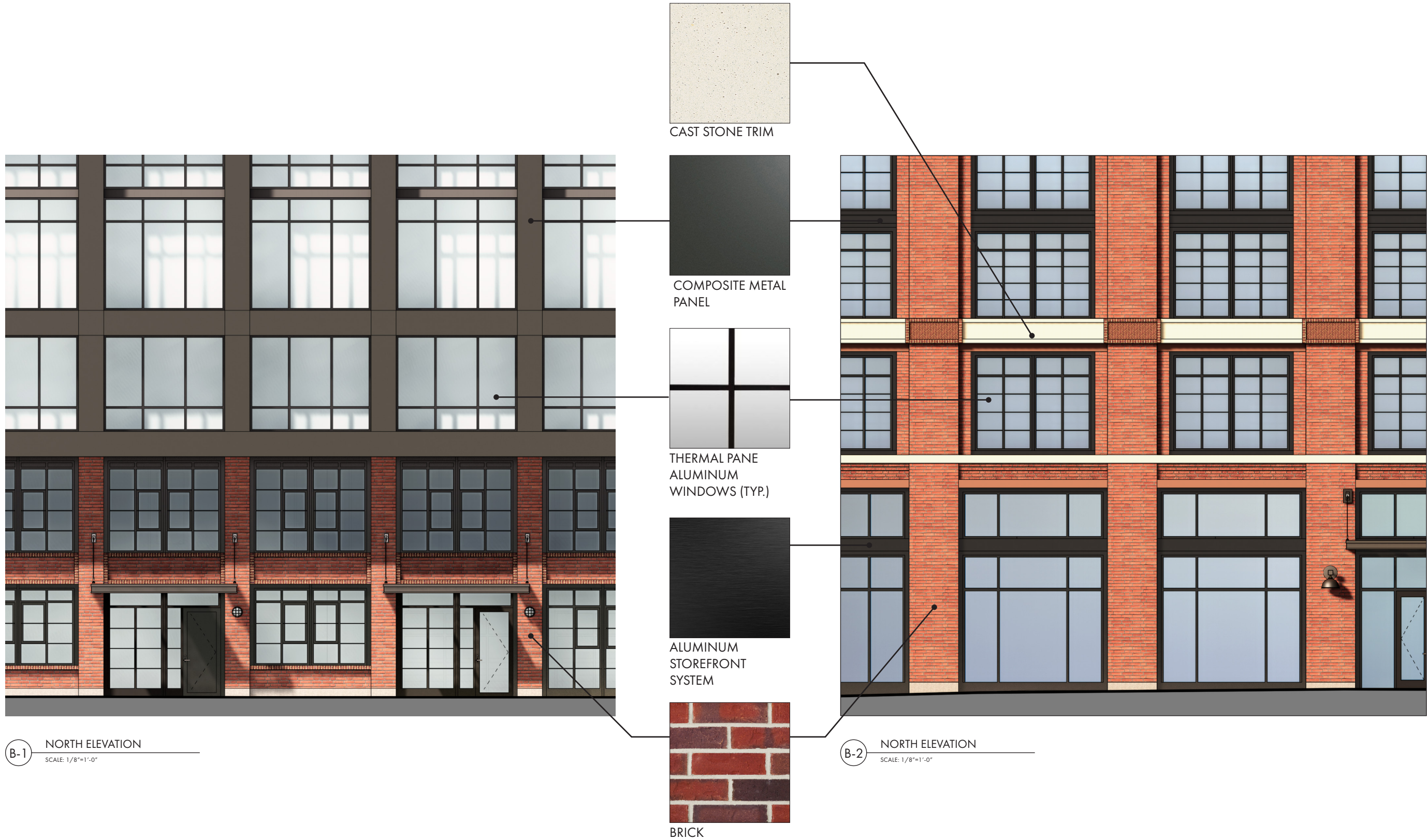
B-1 NORTH ELEVATION SCALE: 1/8"=1'-0"