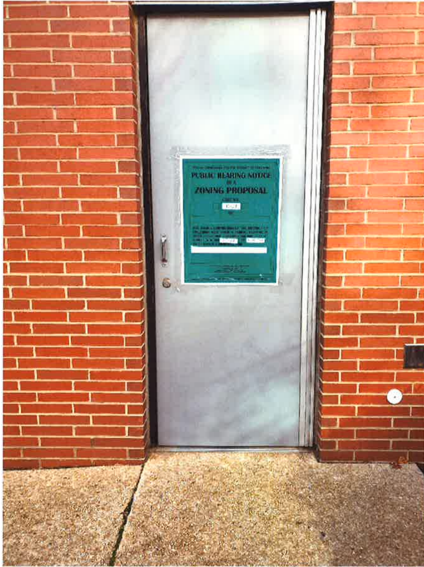
November 26, 2019 - L Street, SE