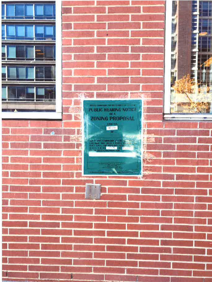
November 26, 2019 - 1st Street, SE