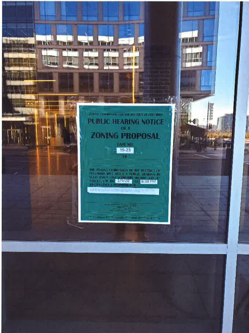
November 26, 2019 - M Street, SE