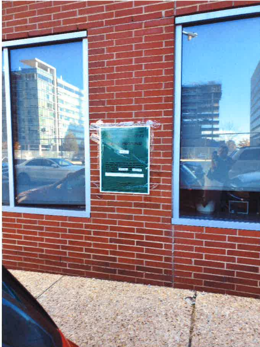
November 26, 2019 - Cushing Place, SE