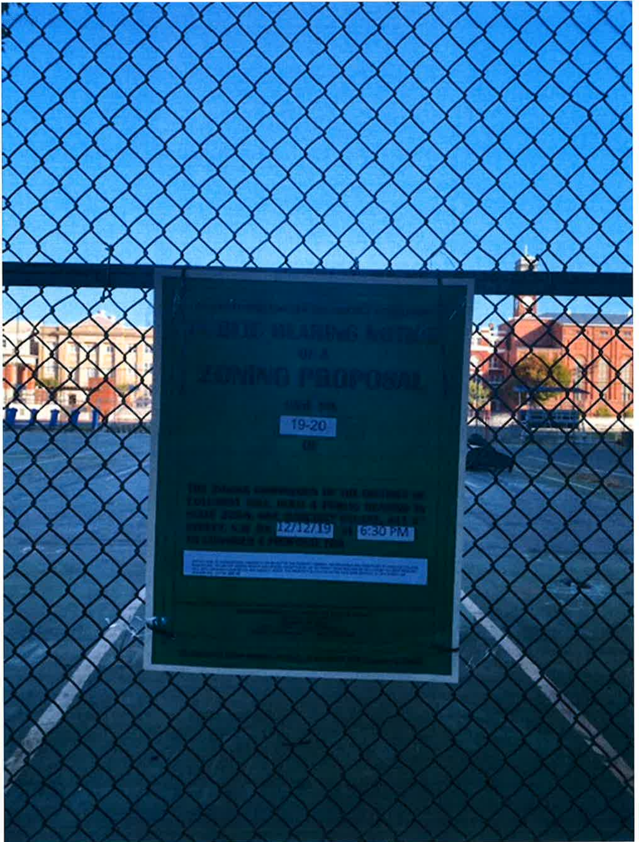
10/24/19 55 H Street NW