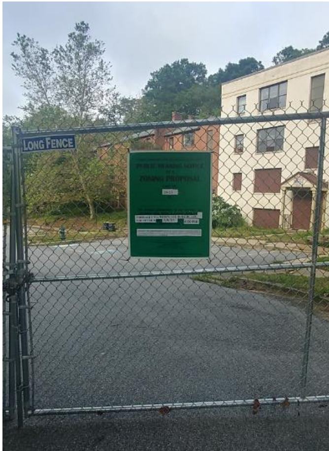
1. 5/29/2020 23rd St SE