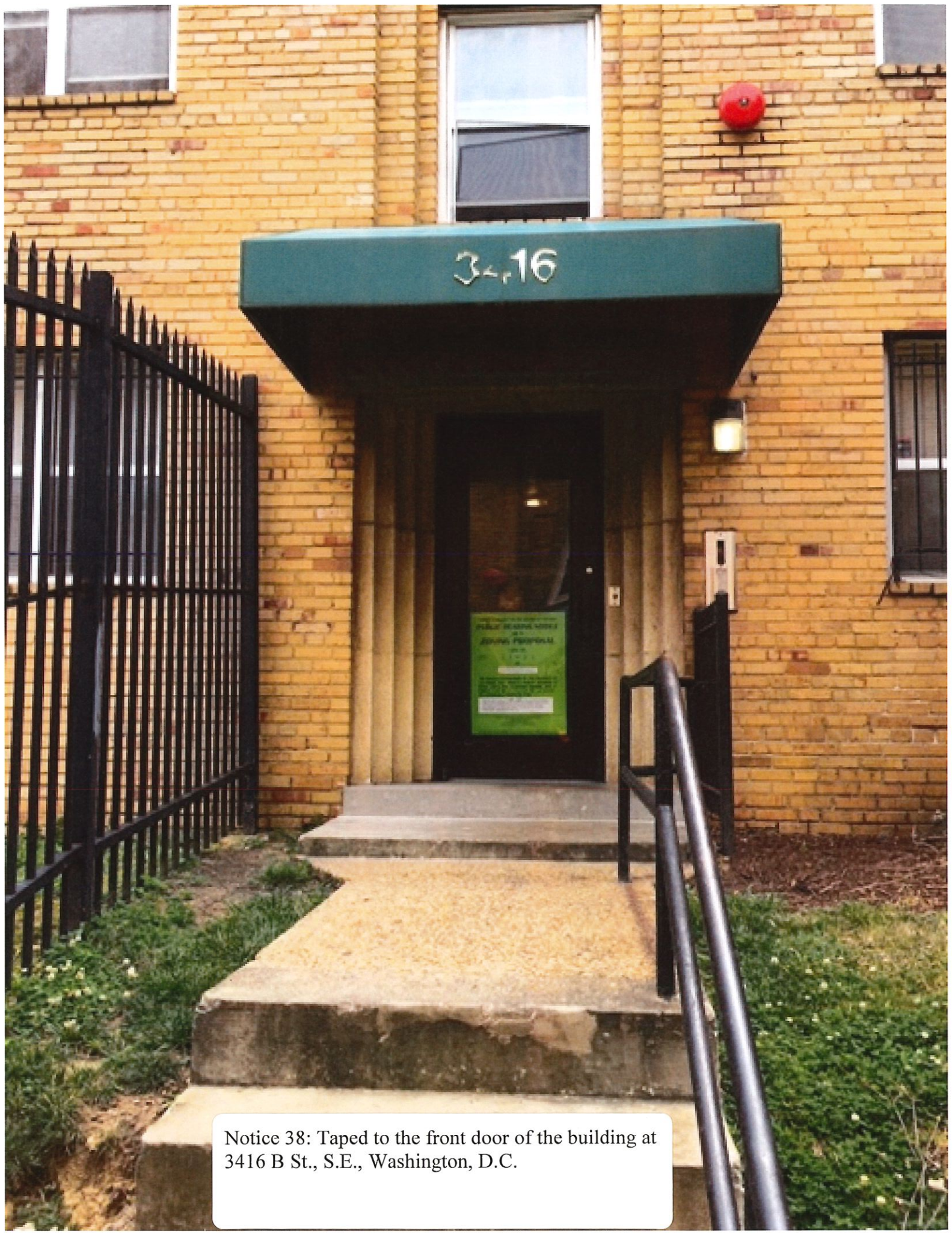
Notice 38: Taped to the front door of the building at 3416 B St., S.E., Washington, D.C.