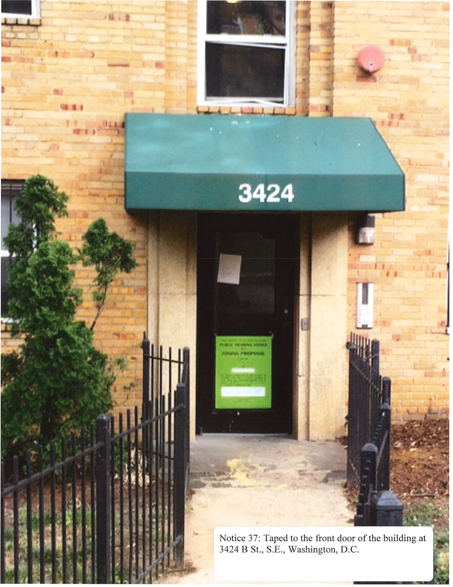
Notice 37: Taped to the front door of the building at 3424 B St., S.E., Washington, D.C.