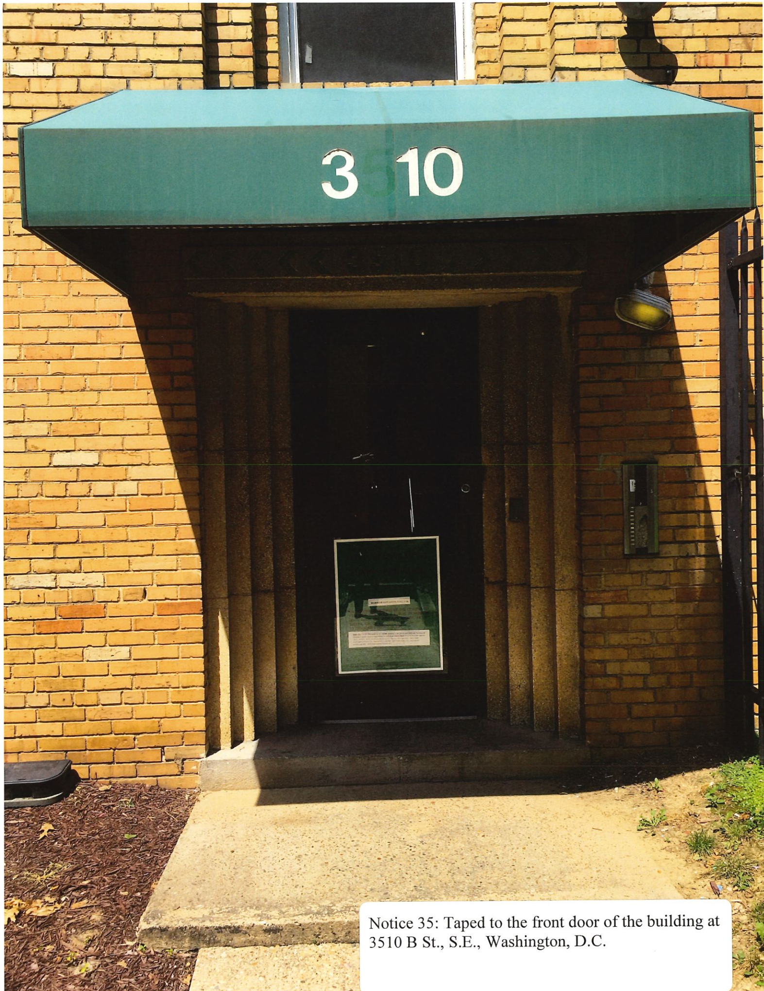
Notice 35: Taped to the front door of the building at 3510 B St., S.E., Washington, D.C.