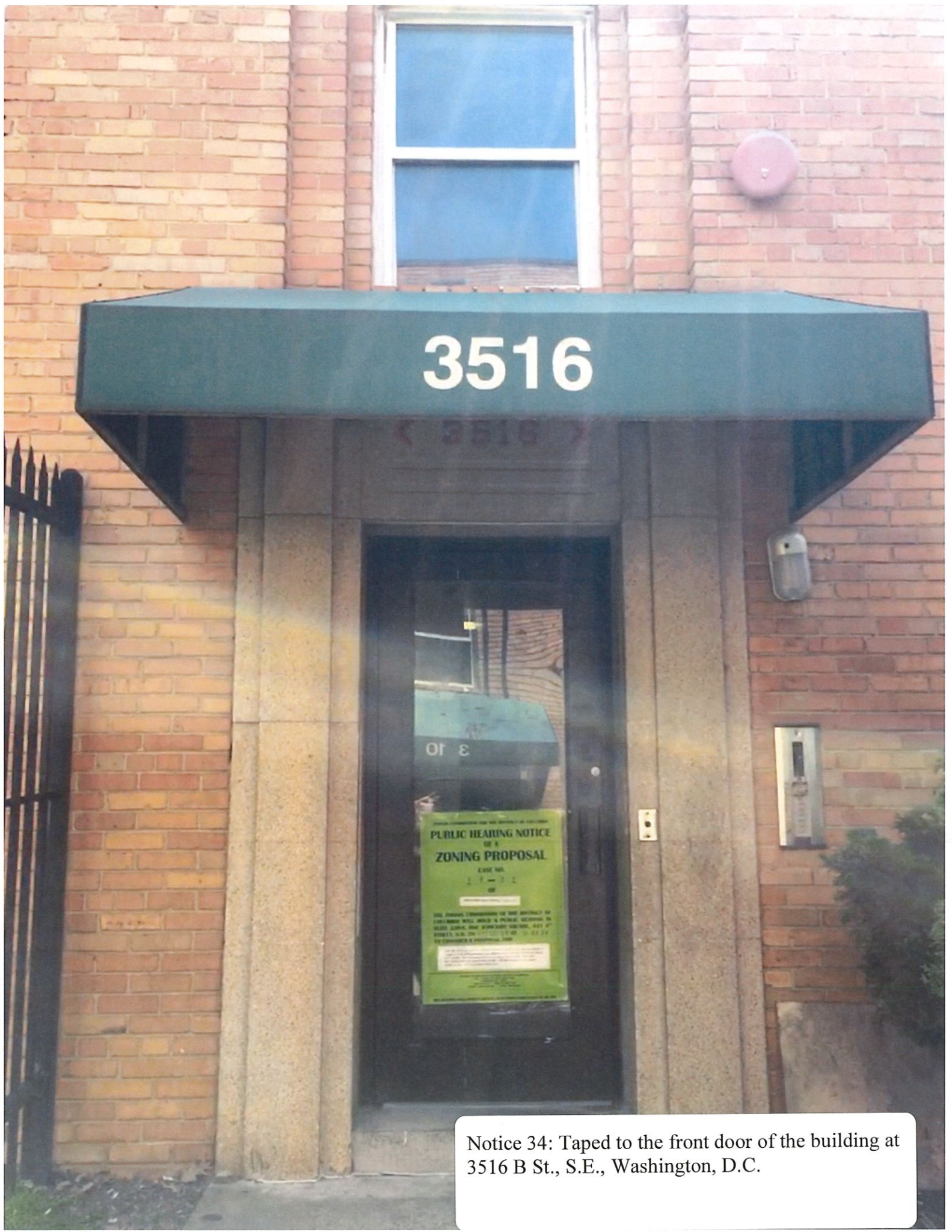
Notice 34: Taped to the front door of the building at 3516 B St., S.E., Washington, D.C.