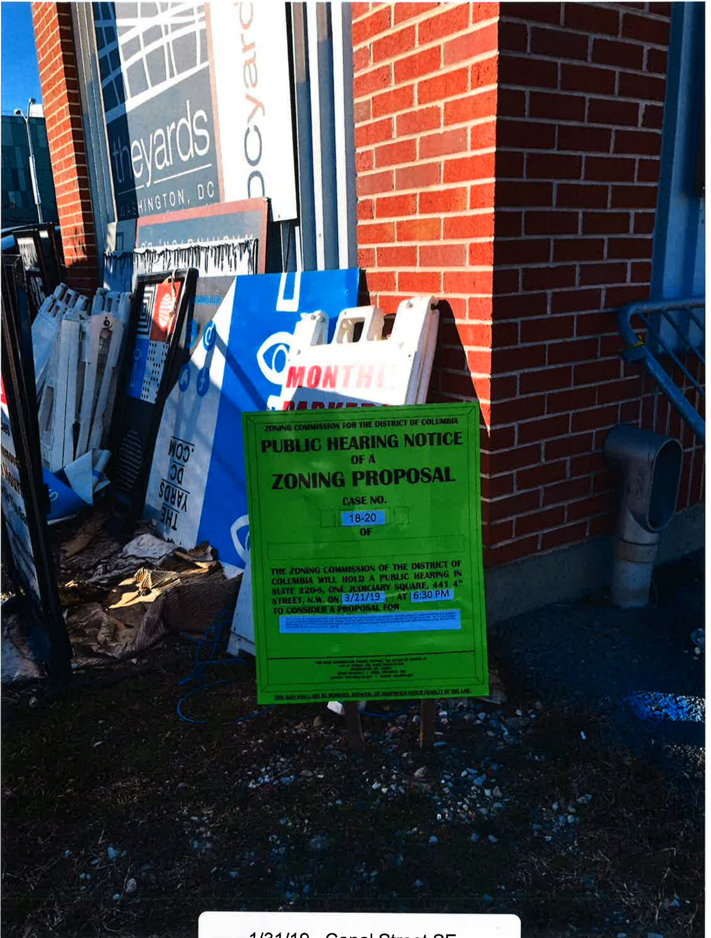
1/31/19 Canal Street SE