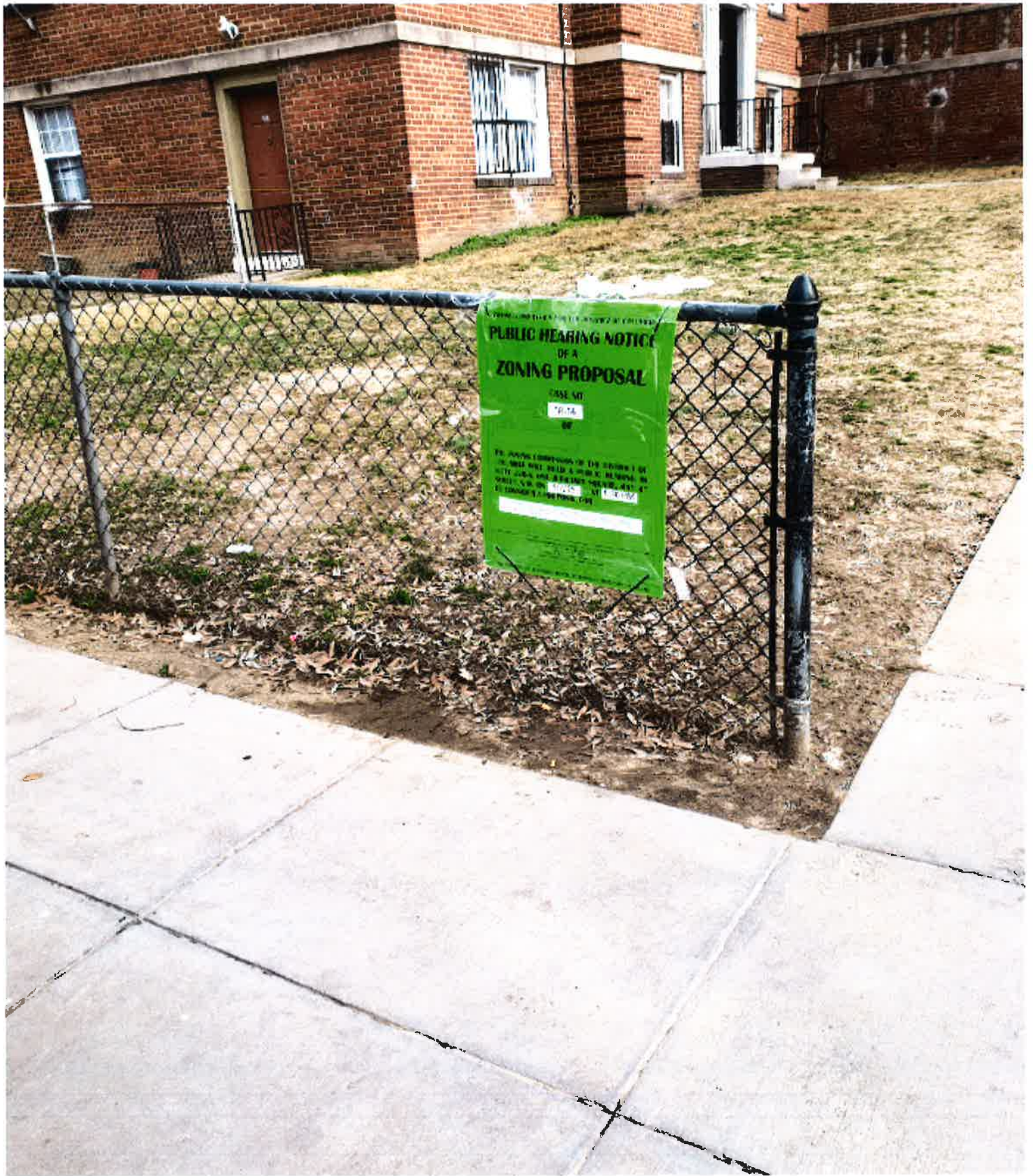
1/23/19 S. Capitol Street SE #1