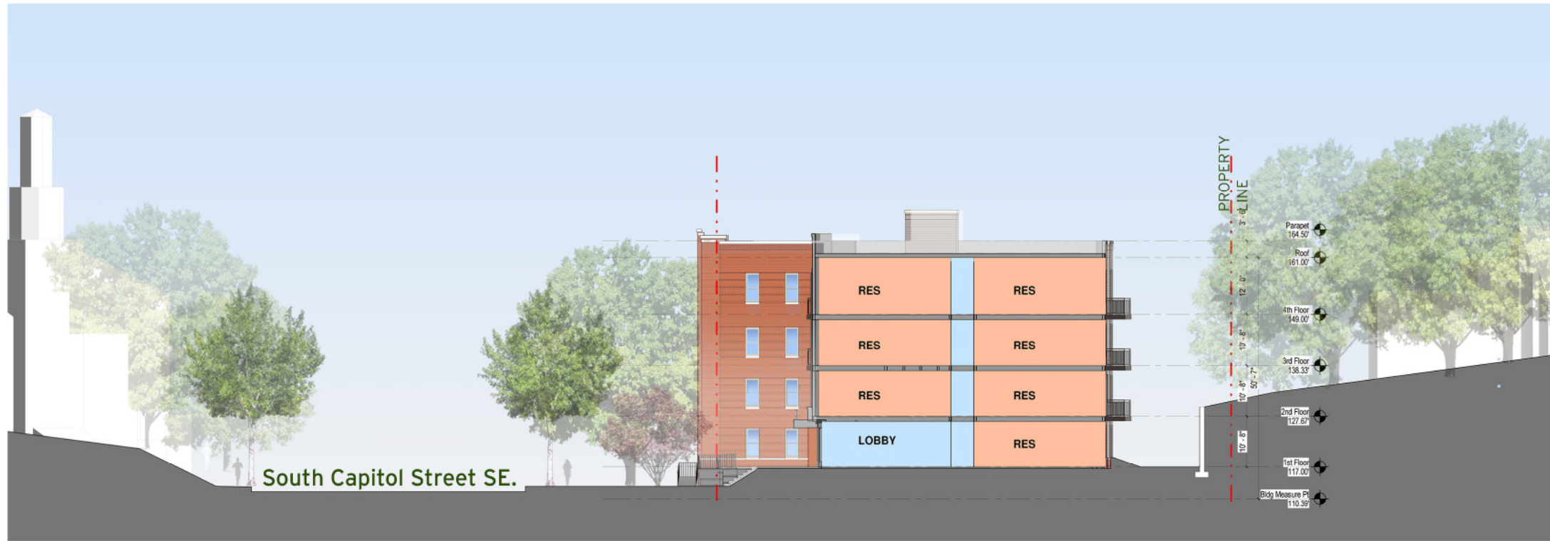
EAST / WEST SECTION B-B