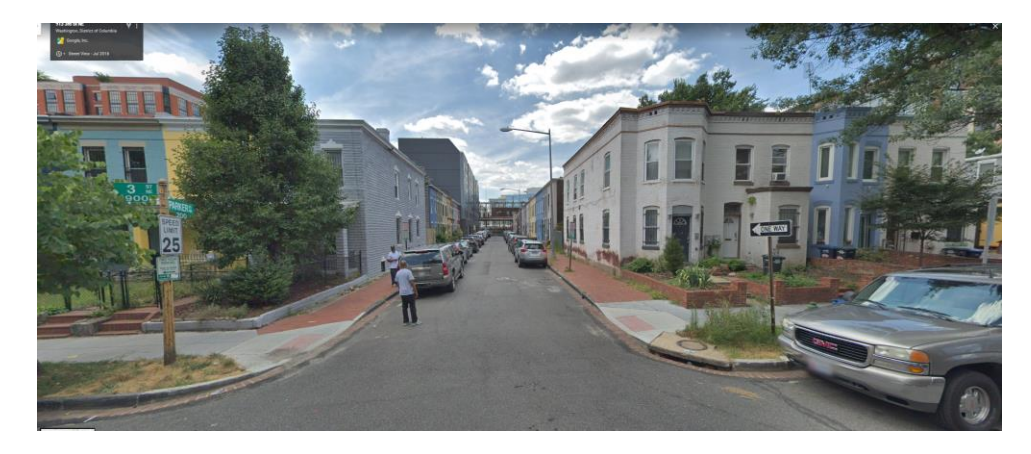
Figure 5. Square 750 from west, at intersection of 3rd and Parker Streets, NE

The petitioner is requesting MU-4 zoning for the site of the red-brick structures on the left side of Figure 4 and half of the open area to the immediate right. MU-5A zoning is requested for the rest of the undeveloped frontage up to and including the site of the white 2-story structure to the right of the tree. The properties with the three 2-story structures to the right of the white building are already zoned MU-5A and are owned by the petitioner.