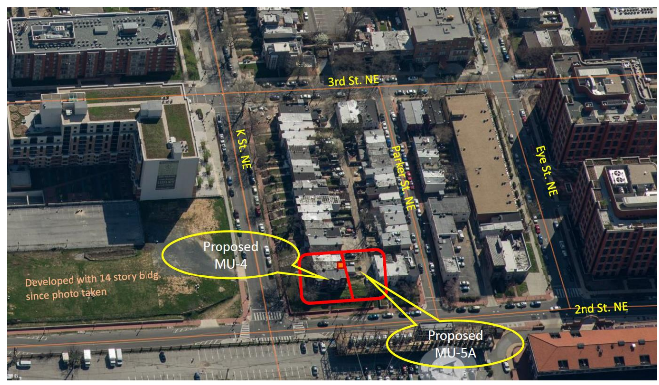
Figure 2. Site Context