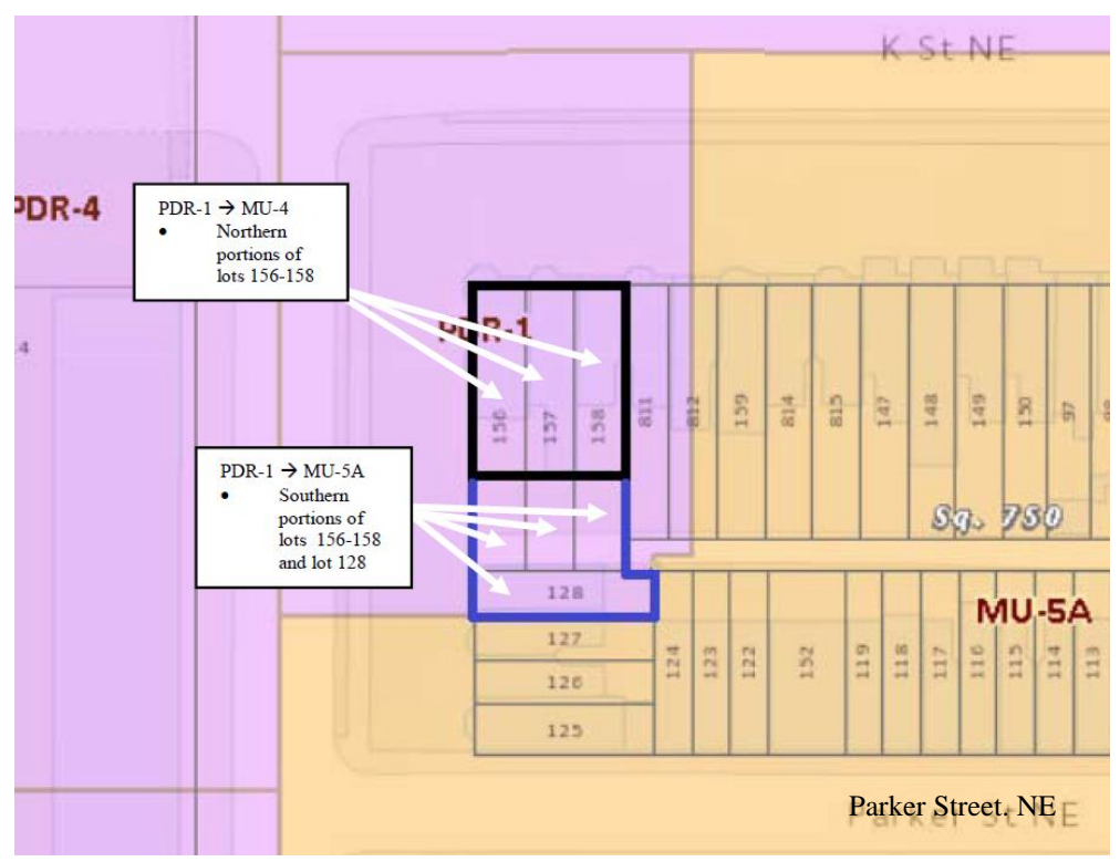
Figure 1. Site of Petitioned Map Amendments, with area to north (in Black) proposed for MU-4 and the area to the south (in Blue) proposed for MU-5A (Case Exhibit 3B).

In the nearby area bounded by G Street, Florida Avenue, 2nd Street, and 4th Street, there are several medium to high-density mixed-use PUD developments that include related map amendments from PDR zones to high-density mixed-use zones. There are also high-density mixed-use PUD developments one block to the south of the applicant's site, along H Street, NE.