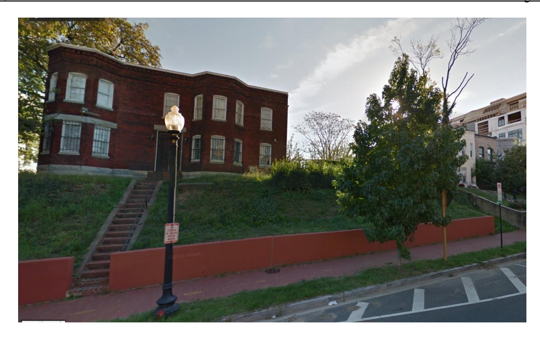
Figure 4. Petitioner's Property, from 2nd Street, NE

The petitioner is requesting MU-4 zoning for the site of the red-brick structures on the left side of Figure 4 and half of the open area to the immediate right. MU-5A zoning is requested for the rest of the undeveloped frontage up to and including the site of the white 2-story structure to the right of the tree. The properties with the three 2-story structures to the right of the white building are already zoned MU-5A and are owned by the petitioner.