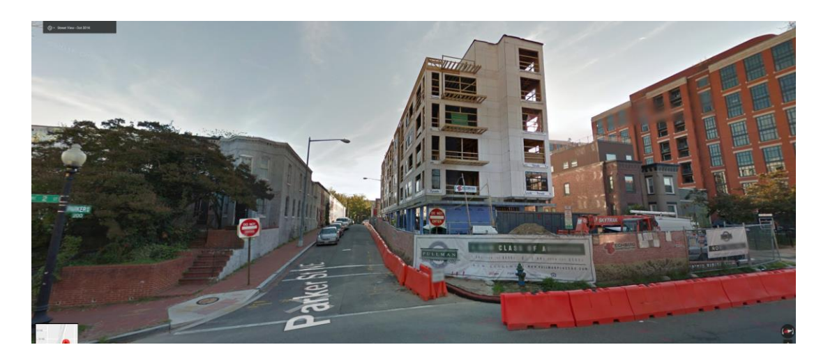
Figure 6. Looking east from 2nd and Parker Streets, NE. 2018

In Figure 6, the building under construction on the right side of Parker Street is the same dark gray building shown in Figure 5. It is in the MU-5A zone. Across Parker Street in Figure 6, the first three lots on the left side are already zoned MU-5A. The existing zone would permit development of a building of similar in height to the one under construction in Figure 6. The requested map amendment, as illustrated in Figure 1 of this report, would extend the MU-5A zone along another third of the block front on 2<sup>nd</sup> Street, and rezone the remaining third of that blockfront and portions of three lots on the south side of the 200 block of K Street to MU-4.