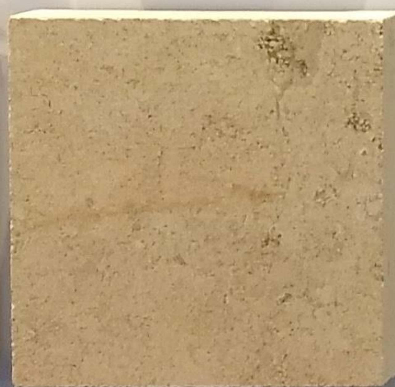
LIMESTONE - HONED