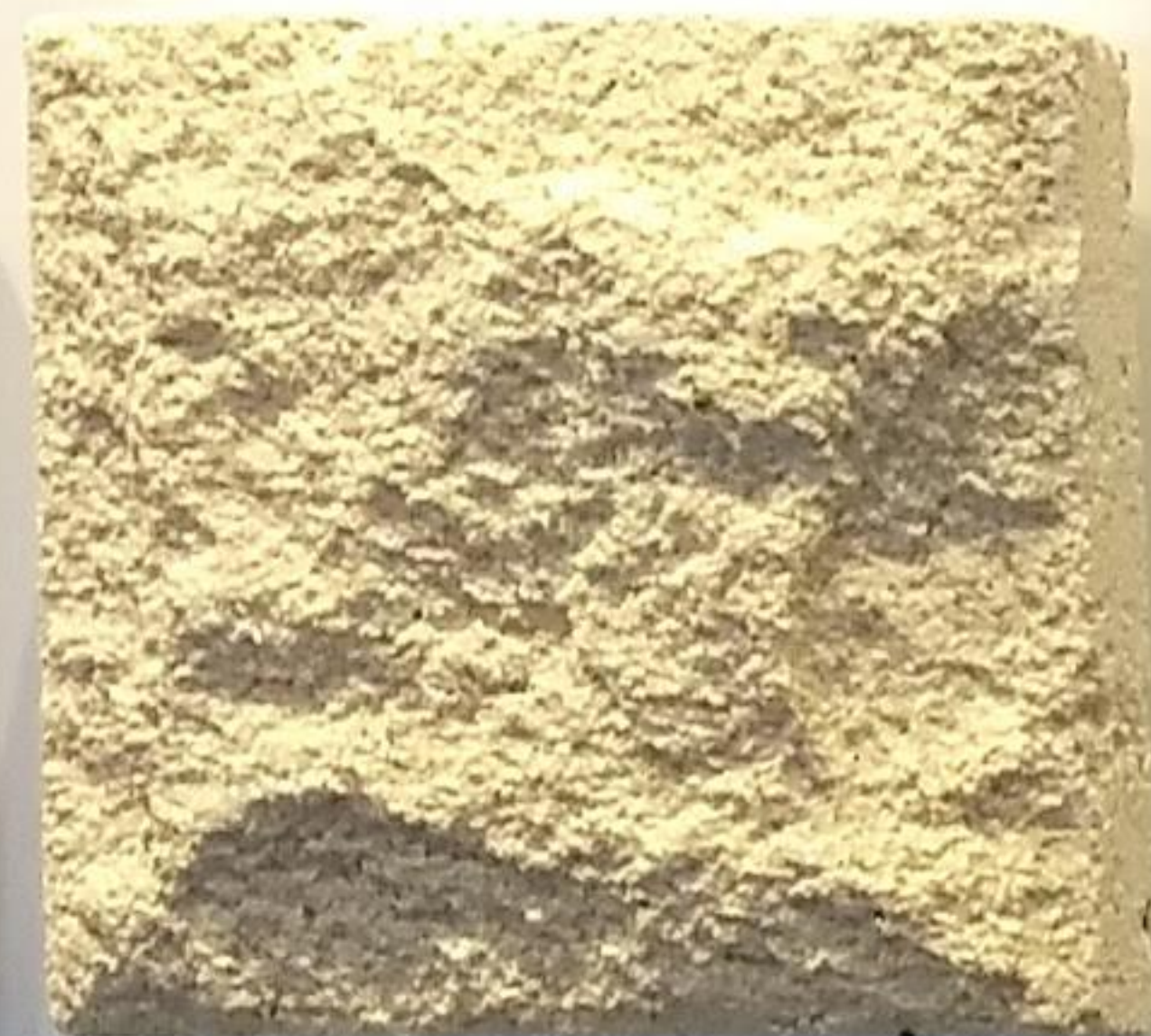
ARCHITECTURAL CAST STONE