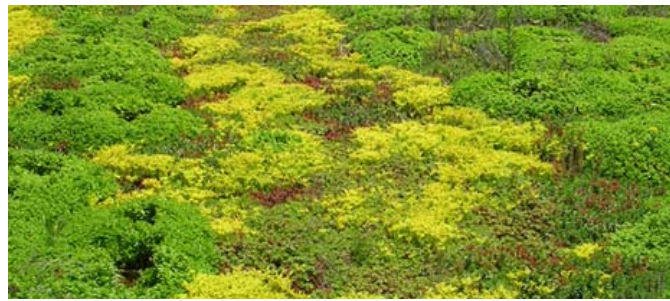
EXTENSIVE GREEN ROOF