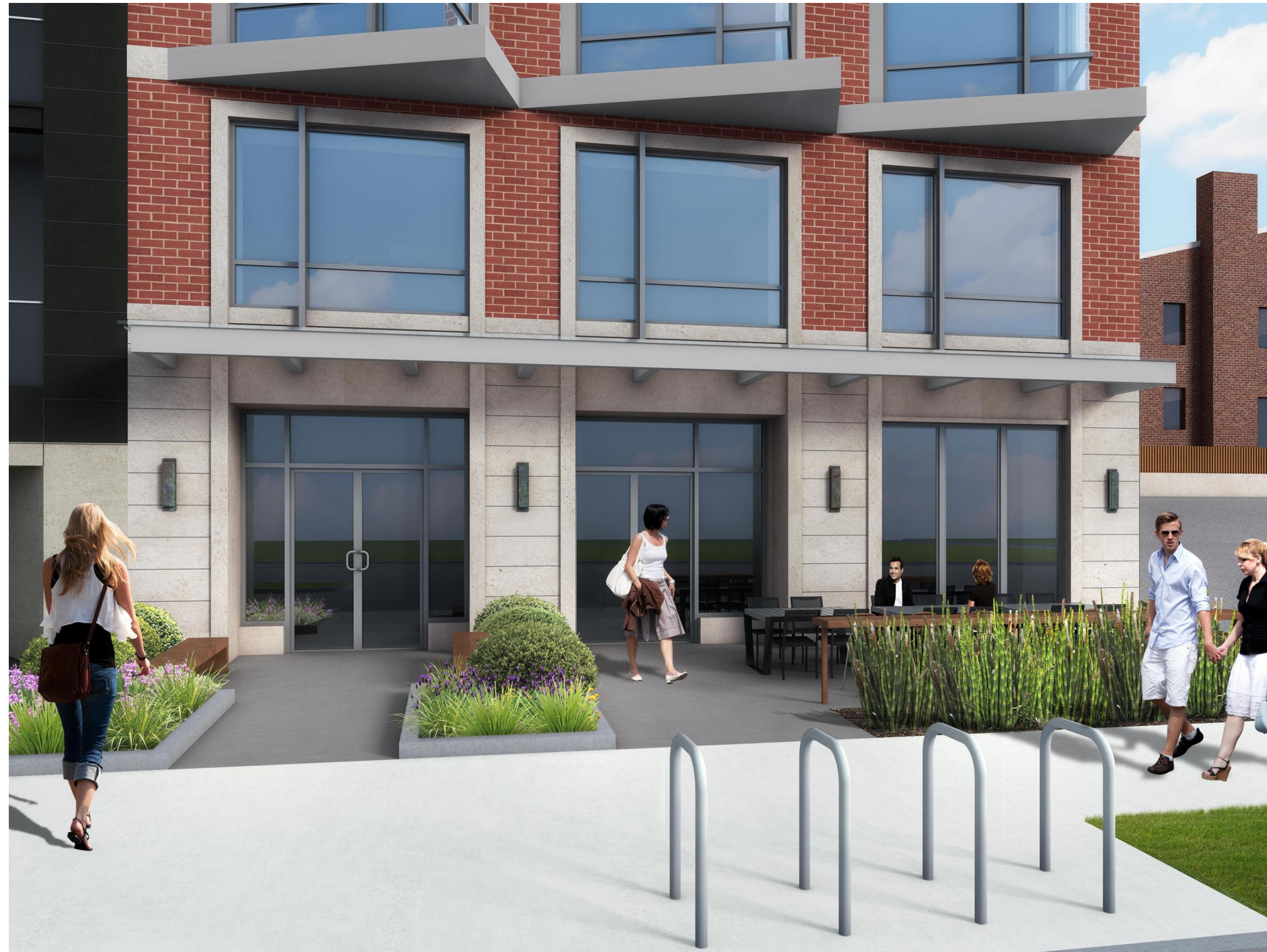
ENTRY/OUTDOOR SEATING AREA: VIEW FROM SIDEWALK

CLIENT Dancing Crab Properties, LLC 1301 RIVER ROAD POTOMAC, MD 20854