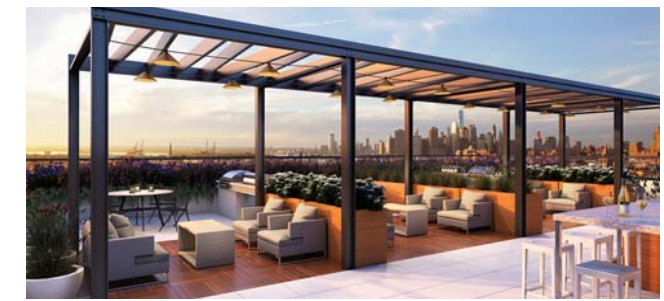
OVERHEAD TRELLIS FEATURE