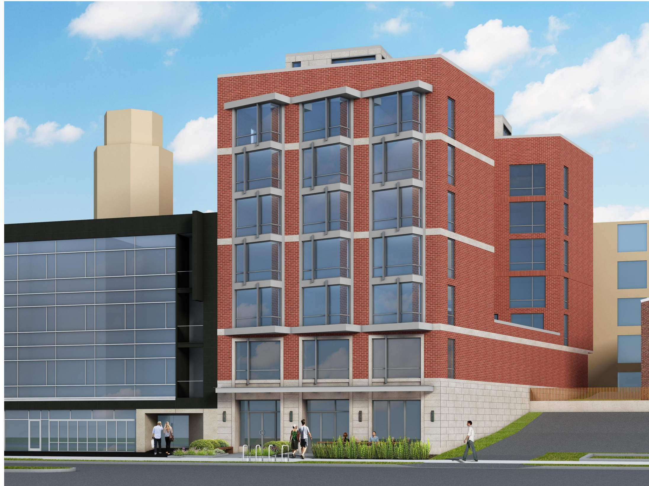
VIEW LOOKING NORTHEAST

CLIENT Dancing Crab Properties, LLC 1301 RIVER ROAD POTOMAC, MD 20854