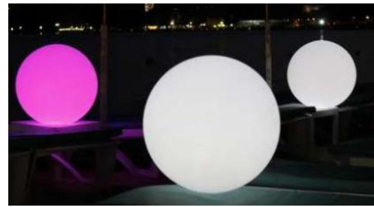
MOVEABLE GLOBE LIGHTS