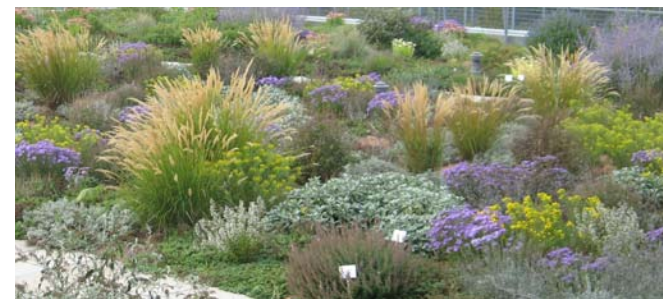
INTENSIVE GREEN ROOF