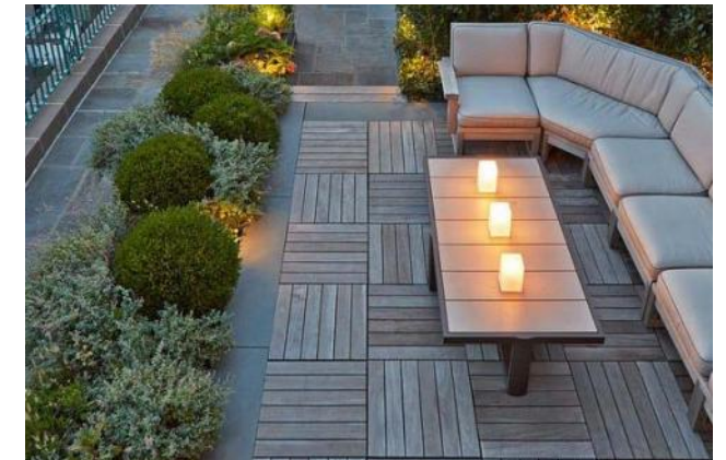
WOOD TILE PAVING