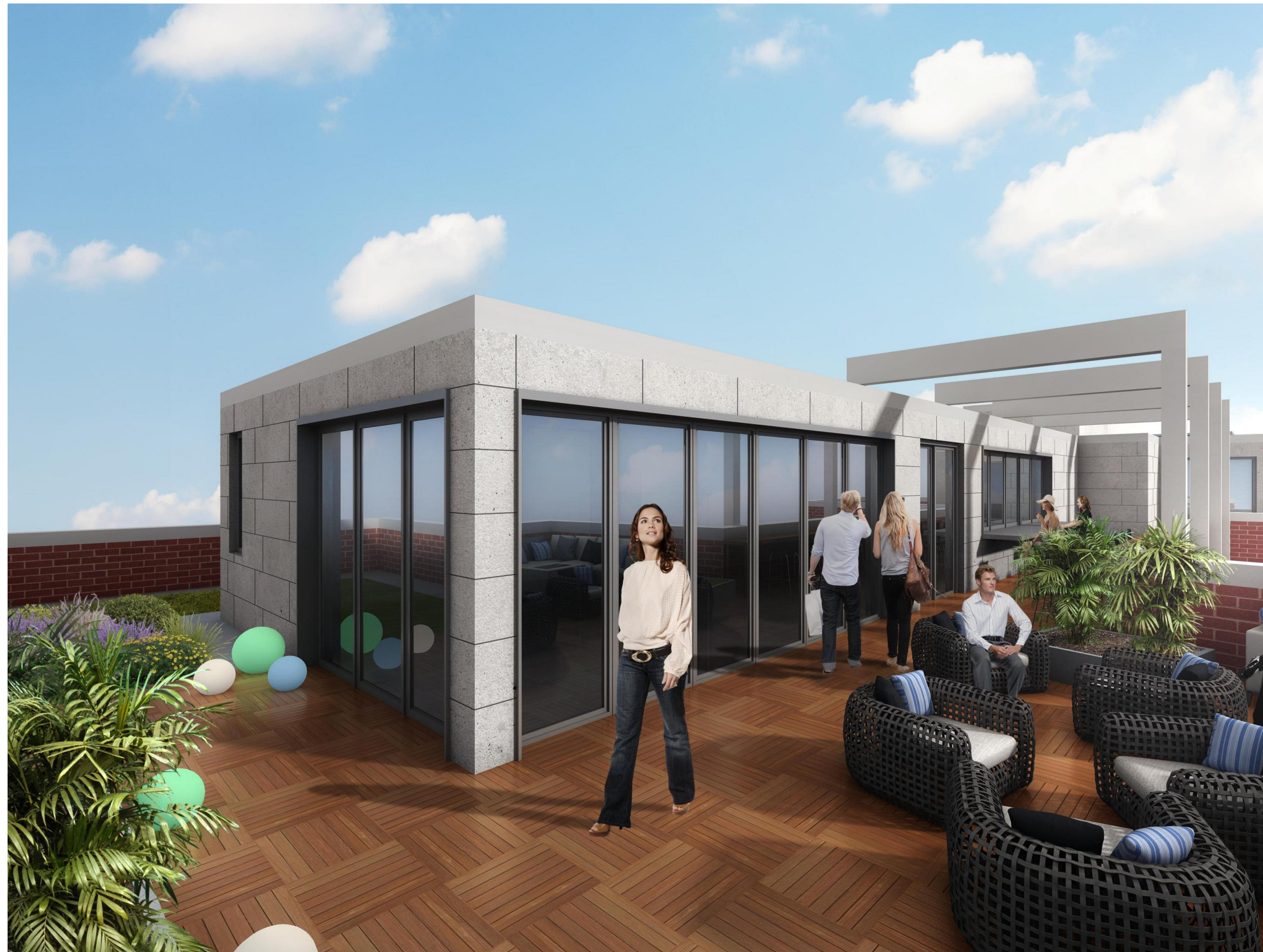
ROOFTOP TERRACE: VIEW LOOKING NORTHEAST

CLIENT Dancing Crab Properties, LLC 1801 RIVER ROAD POTOMAC, MD 20854