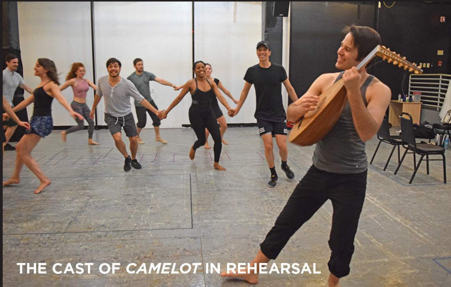
THE CAST OF CAMELOT IN REHEARSAL