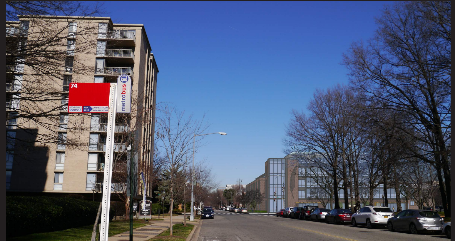
VIEW FROM 6TH LOOKING NORTH