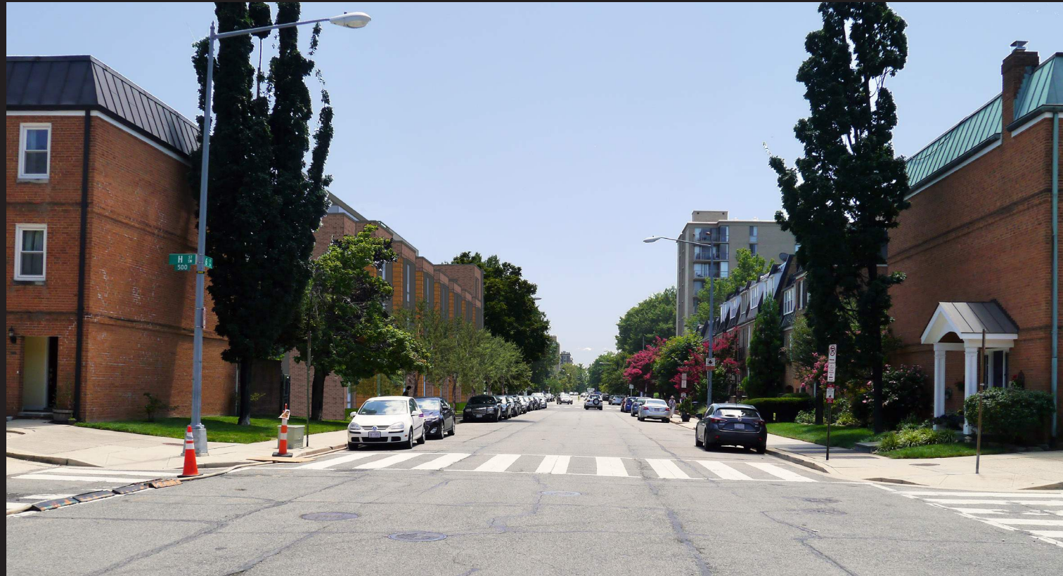
VIEW FROM 6TH LOOKING SOUTH