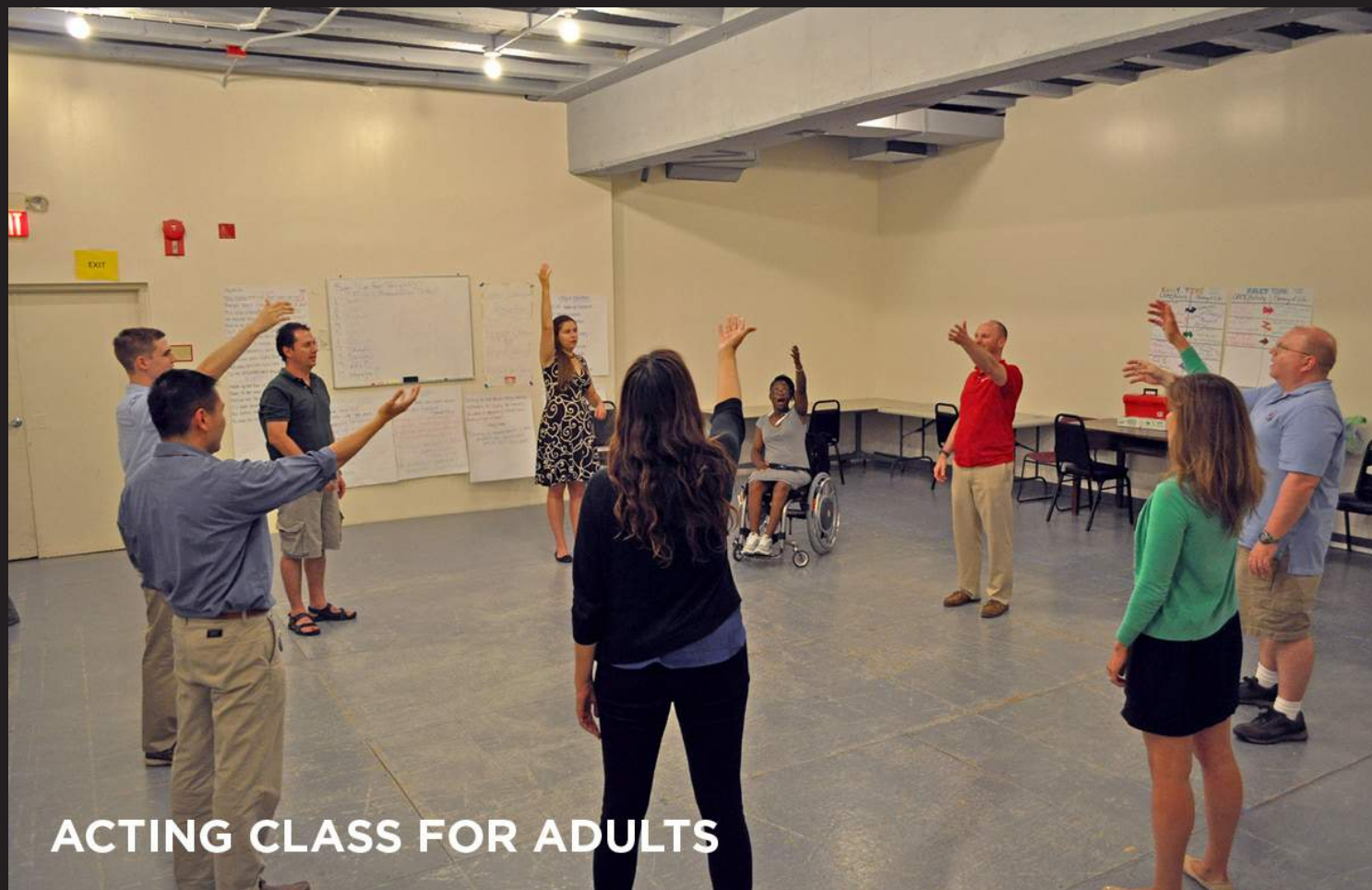
ACTING CLASS FOR ADULTS