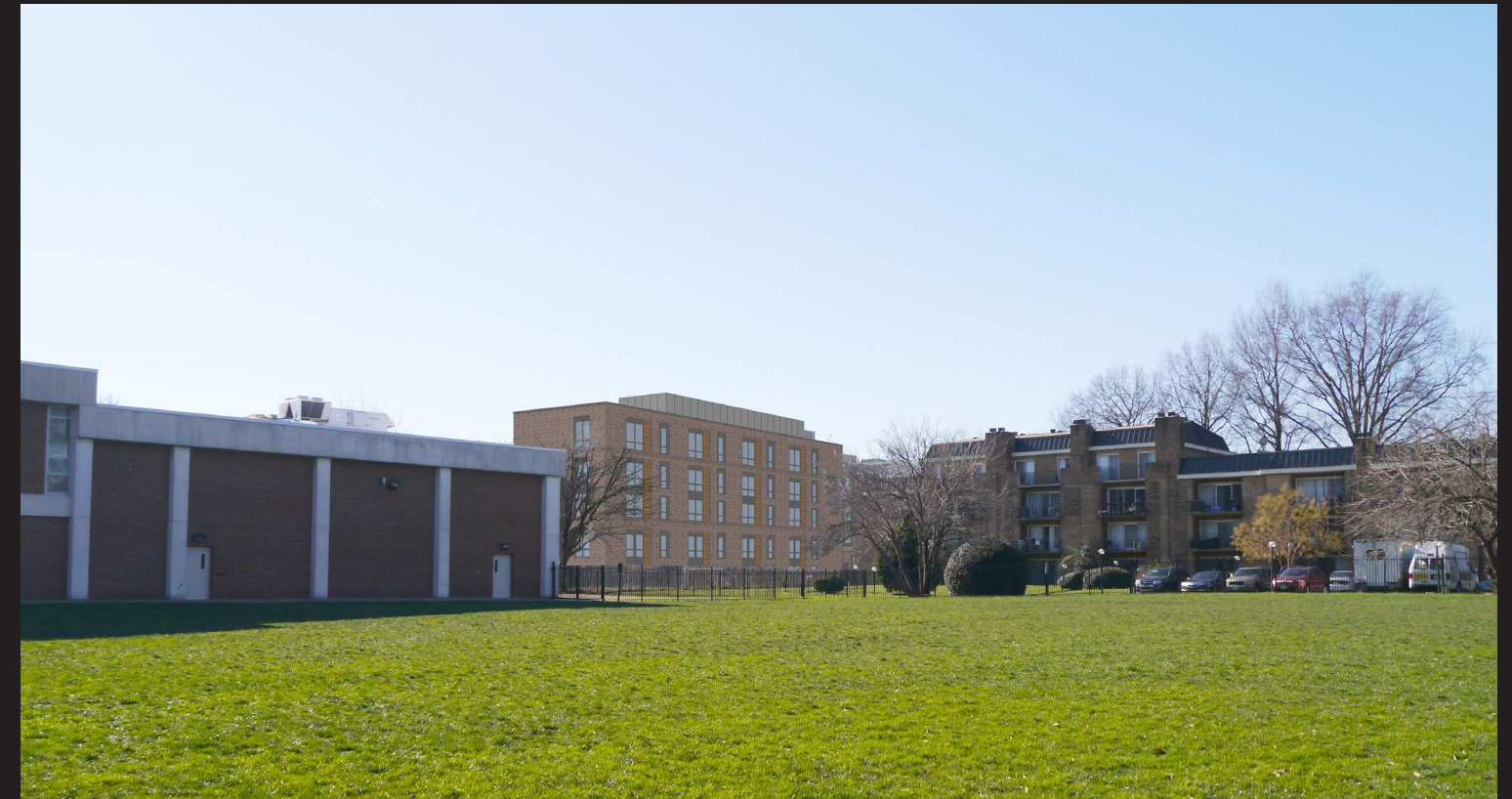
VIEW FROM BALL FIELD LOOKING SOUTHWEST