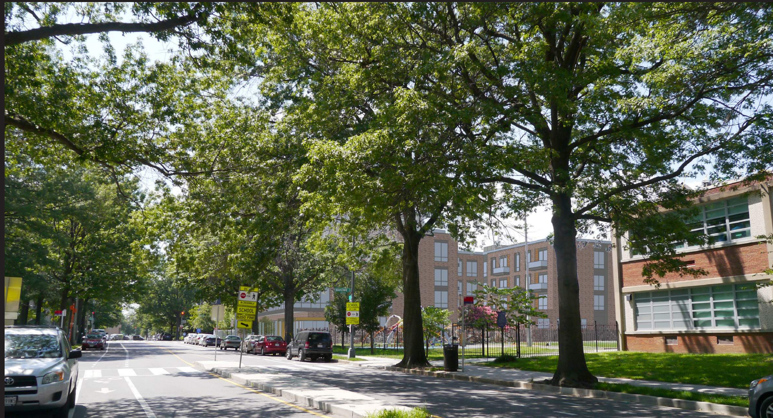
VIEW FROM EYE LOOKING WEST