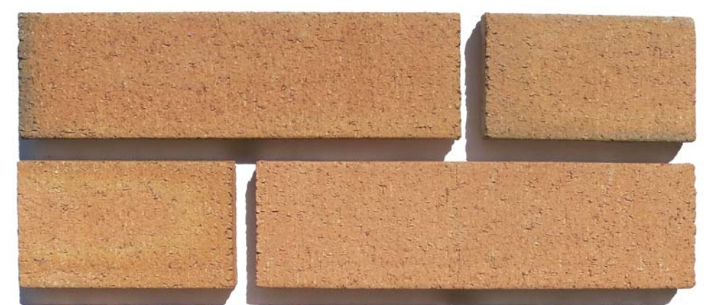
Masonry Color #5