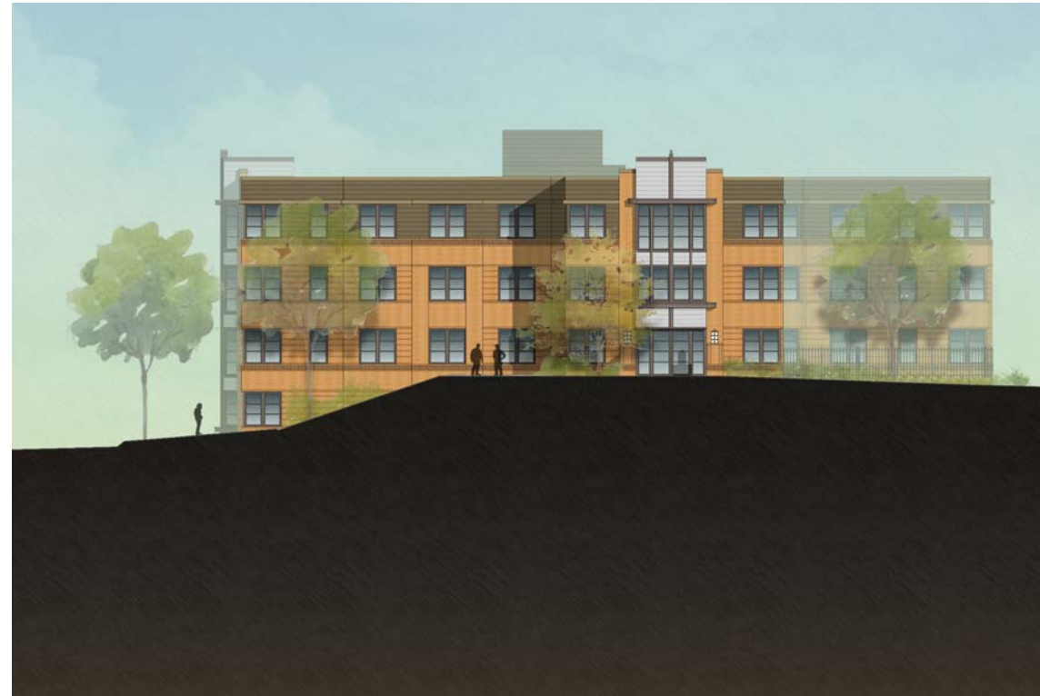
2 South Elevation