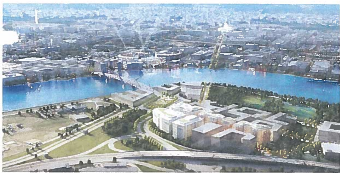
Figure 2 View of proposed PUD looking northwest, toward the US Capitol Building

Pursuant to delegations of authority adopted by the Commission on August 6, 1999 and per 40 U.S.C. § 8724(a) and DC Code § 2-1006(a), I find the proposed First Stage Planned Unit Development and Related Map Amendment at Squares 5860 and 5861, Poplar Point RBBR, LLC located on Howard Road, SE between South Capitol Street and the Anacostia Freeway / I-295, Washington, DC, is not inconsistent with the Comprehensive Plan for the National Capital and other federal interests.