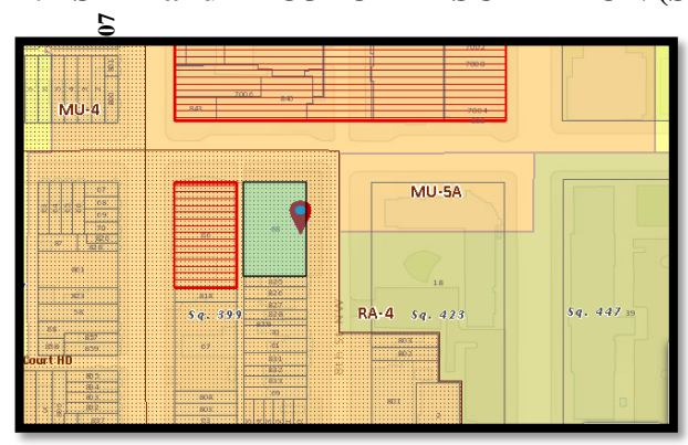
Figure 1 Location and Zoning

The 13,306 square foot lot is within the Shaw neighborhood and Shaw historic district, one block north of the Washington Convention Center and across from the O Street Market mixed-use development approved in PUD 07-26. The site is currently a surface lot used by the Church of the Immaculate Conception ("the Church"). Mixed-use and denser/taller development is located