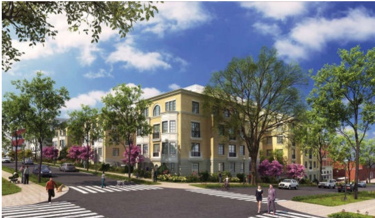
Valor Development, L.L.C. rendering A19: View from Northeast - Proposed (48 th and Yuma Street)

This is not how the eye perceives the world. As portrait photographers have long realized, and studies have shown, a mild telephoto lens (say 1.8 to 2 times the "normal" lens focal length) yields a more realistic perspective 1 . Why this more "accurate" projection was not used in the renderings now can only be guessed.