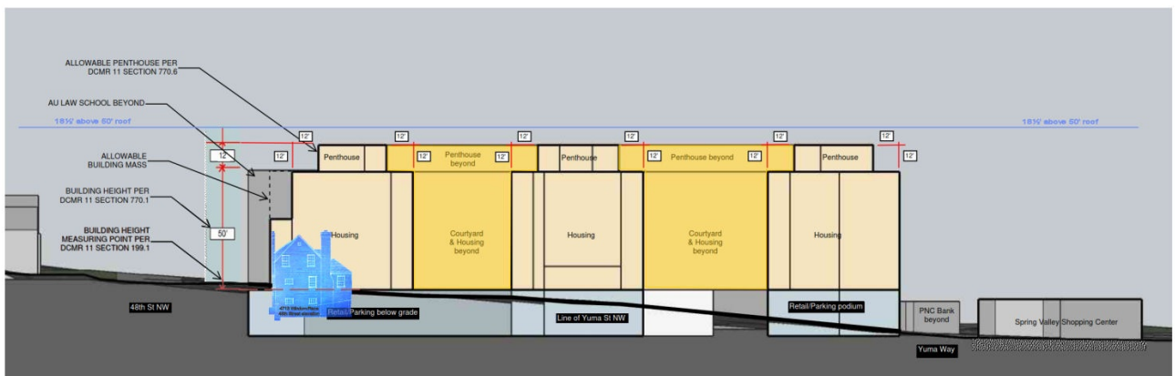
Blueprint of 4713 Windom Place, N.W. reduced to the scale of Valor Development, L.L.C. site rendering, with first floors at same elevation.

Below, I repeat another of Valor’s renderings showing the Yuma Street elevation compared to the scaled west elevation of my house, with the first floors aligned. I have done so since this rendering includes the Massachusetts Avenue Parking Shops building (labeled “Spring Valley Shopping Center”).