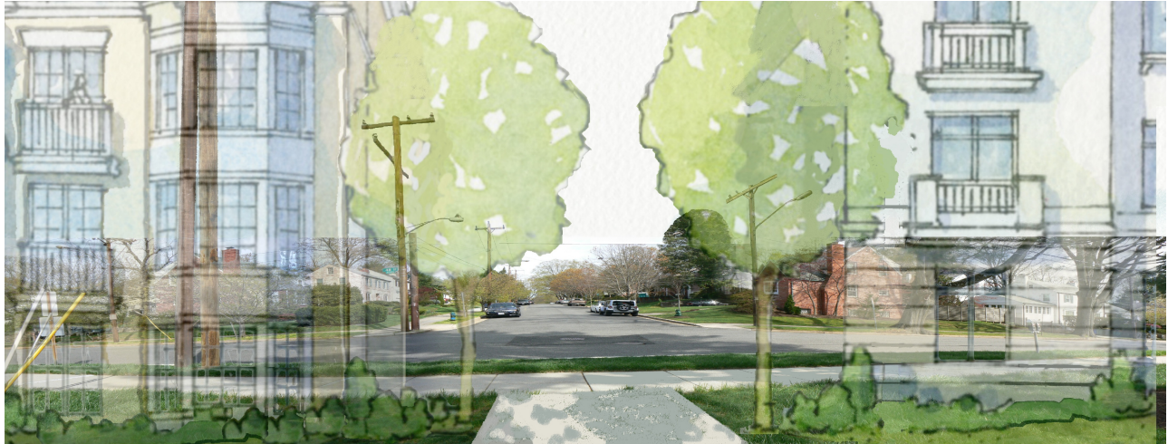
View from between the proposed buildings looking across 48 th Street, up Windom Place using perspective of Valor's renderings.

the two proposed buildings, looking across 48 th Street and up Windom Place would appear. In order that more of the houses on either side of the street may be seen, I have made Valor's walls partially transparent. You'll immediately notice how large the proposed building facades are and how small the houses up Windom Place appear. Just the opposite of Valor's submitted renderings.