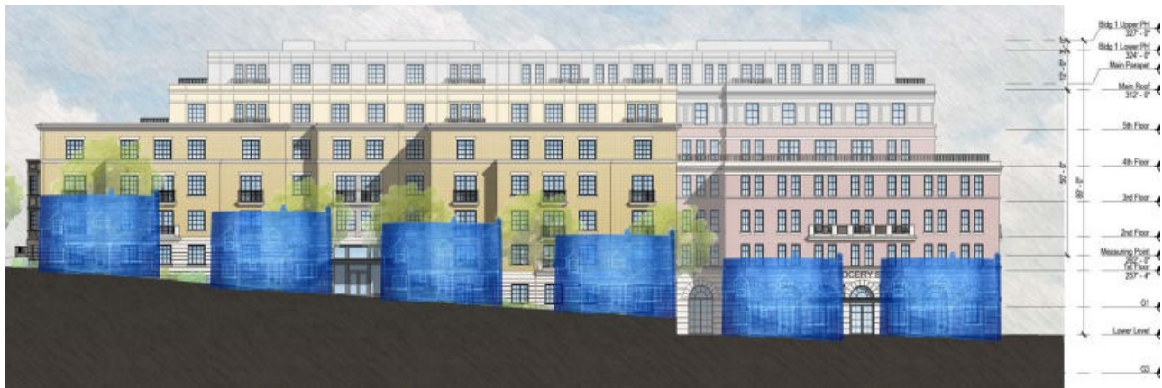
Valor Development, L.L.C. rendering A36: North Elevation -Yuma Street with blueprints of 4713 Windom Place, N.W. to same scale, ground levels matched

Below, I repeat another of Valor’s renderings showing the Yuma Street elevation compared to the scaled west elevation of my house, with the first floors aligned. I have done so since this rendering includes the Massachusetts Avenue Parking Shops building (labeled “Spring Valley Shopping Center”).