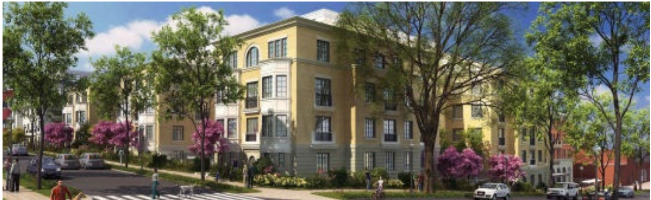
Valor Development, L.L.C. rendering A19 cropped to focus on proposed buildings

Along with this distorted perspective, the renderings attempt to place the proposed buildings themselves in the background at a remove. If A19 is cropped to show the proposed buildings, instead of the crosswalk and beautiful blue sky, a better sense of their massive size is apparent.