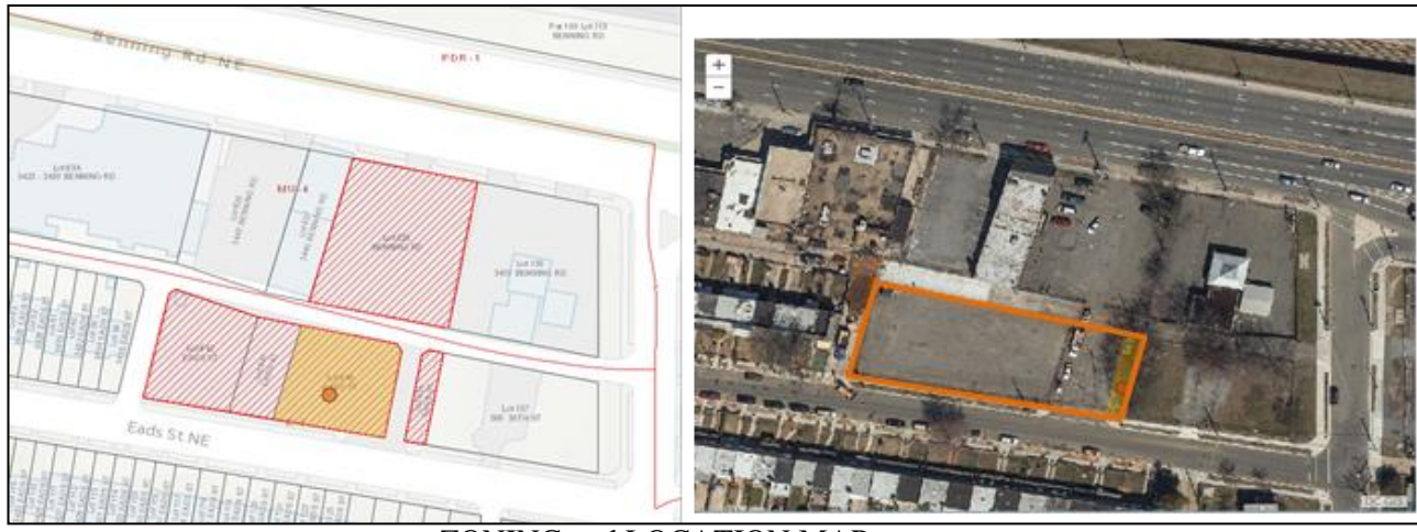
ZONING and LOCATION MAP