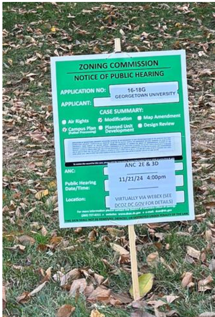
11/7/2024 # 18