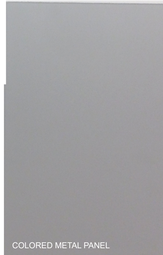
COLORED METAL PANEL