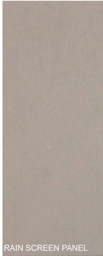
RAIN SCREEN PANEL