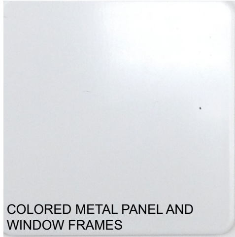
COLORED METAL PANEL AND WINDOW FRAMES