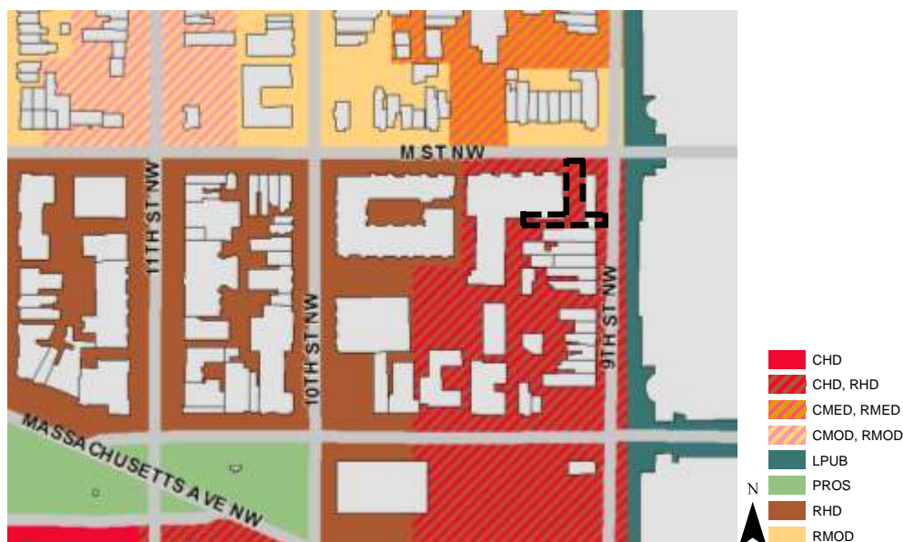
Future Land Use Map

The proposed development is not inconsistent with the land use designation, which supports the construction of a dense residential project with lower level commercial uses on a site that is currently underutilized.