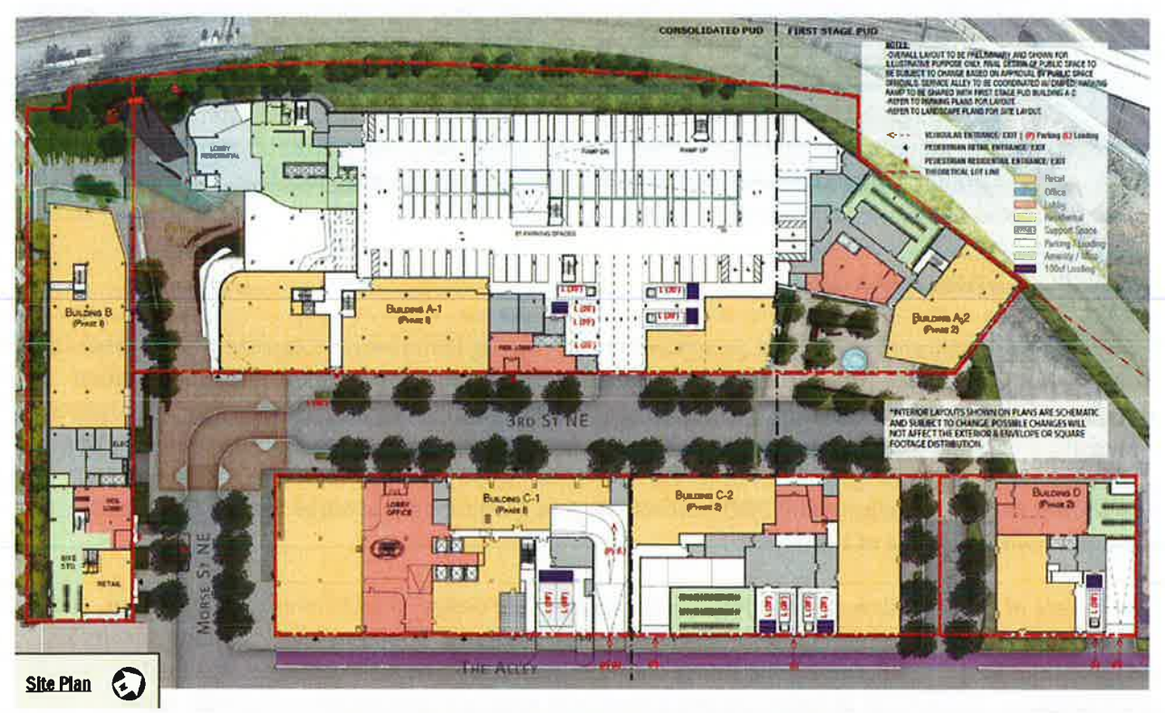
Figure 1 Site Design and Access

The new street network has the potential to disperse site traffic throughout the site in a way that minimizes the action's impact on the road network in the vicinity. The new roads serve as vehicle, bicycle, and pedestrian access points for the site. All streets are proposed to be private but are expected to meet DDOT construction standards. Of note, as private streets, the Applicant is responsible for maintenance, snow removal, and curbside management and enforcement.