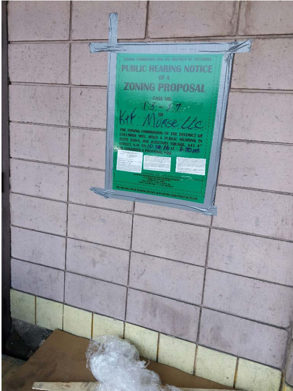
4. ZC 15-27 325 Morse Street, NE Posted 9/7/16