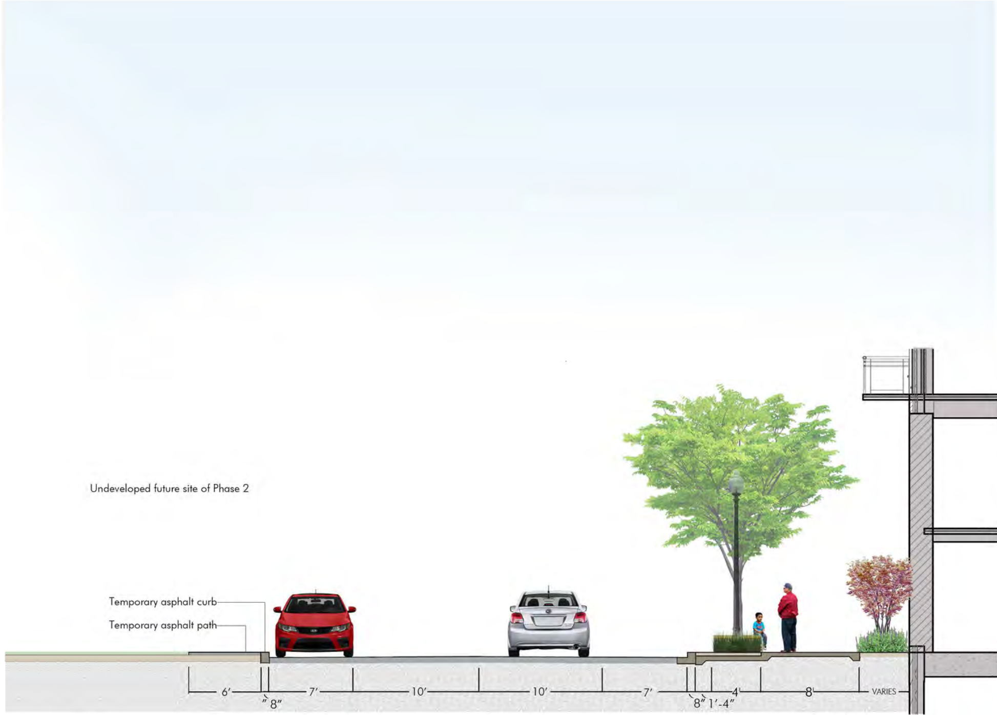
PIERCE STREET - INTERIM CONDITION SECTION