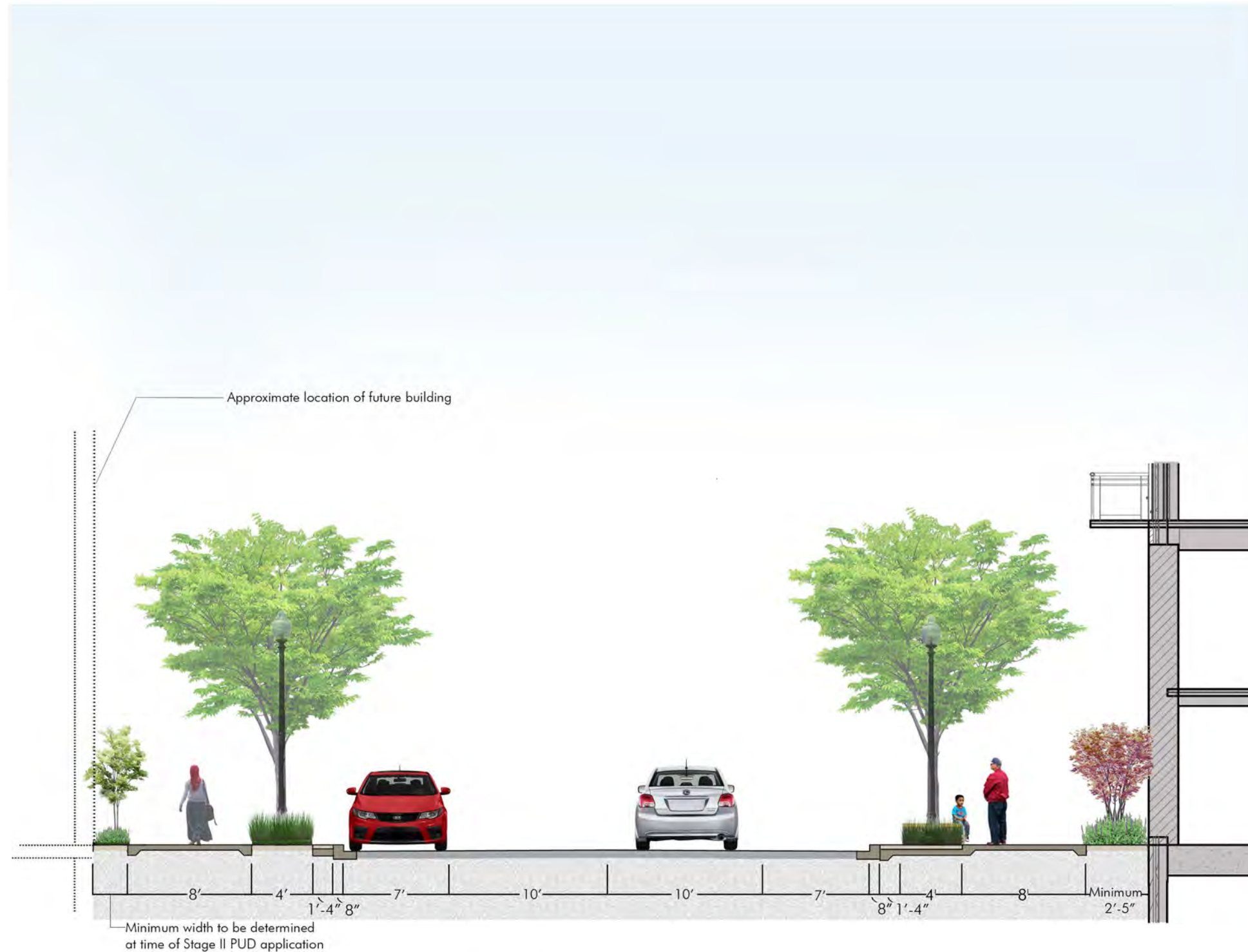
PIERCE STREET - FINAL CONDITION SECTION